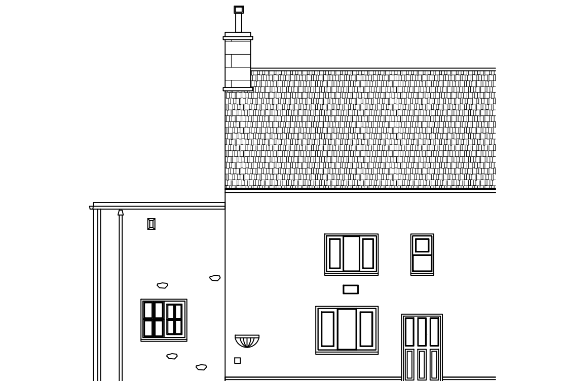
EXISTING FRONT ELEVATION SCALE 1:100 AT A3