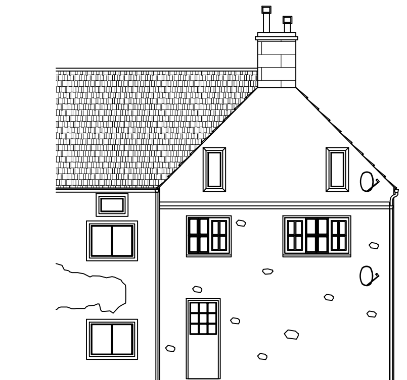
EXISTING END ELEVATION SCALE 1:100 AT A3