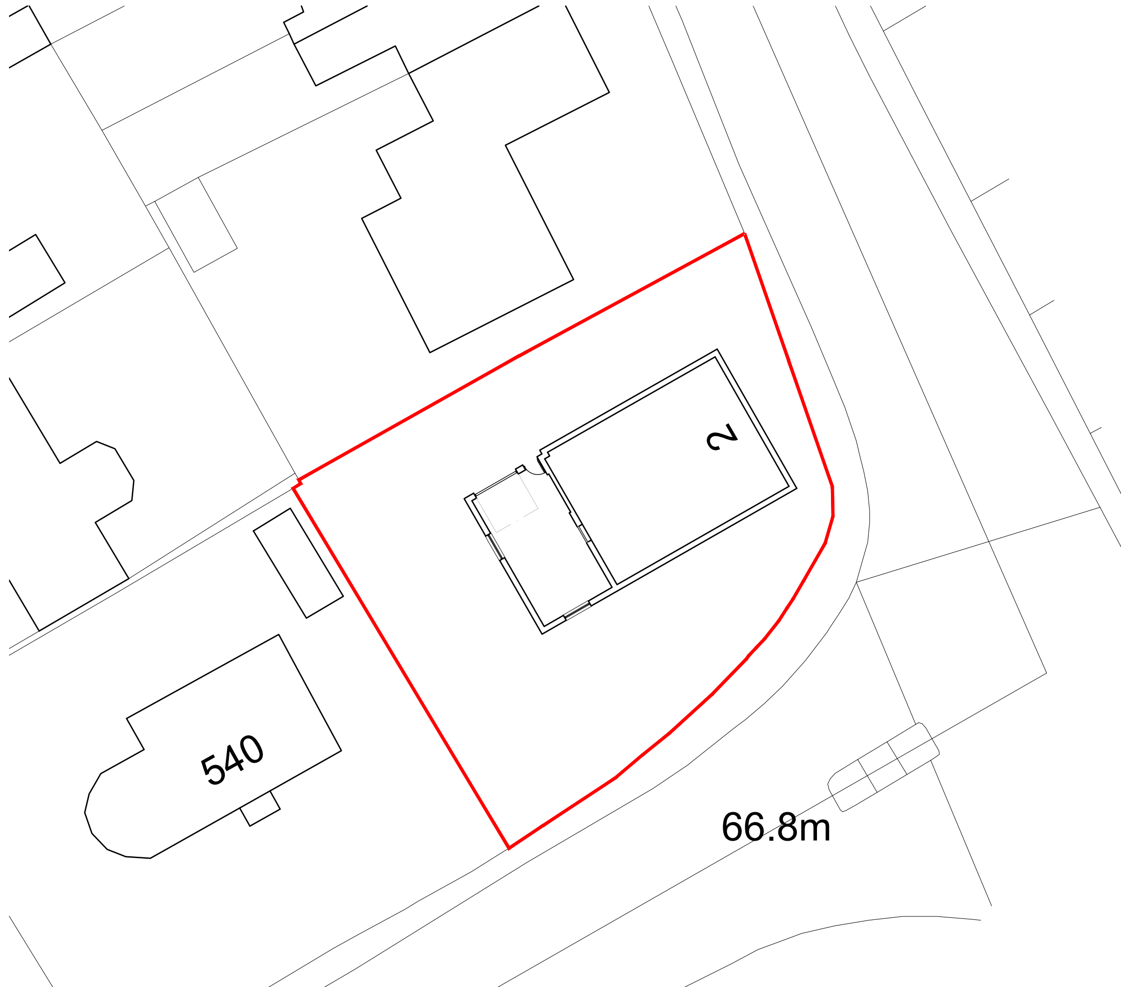
Existing Site Plan 1:200