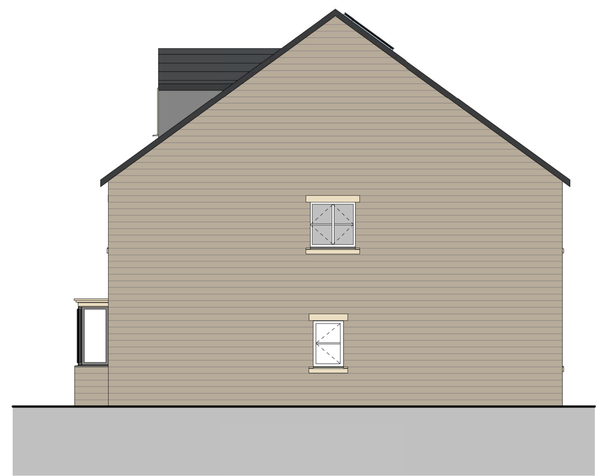
2 Side Elevation 01 1 : 50