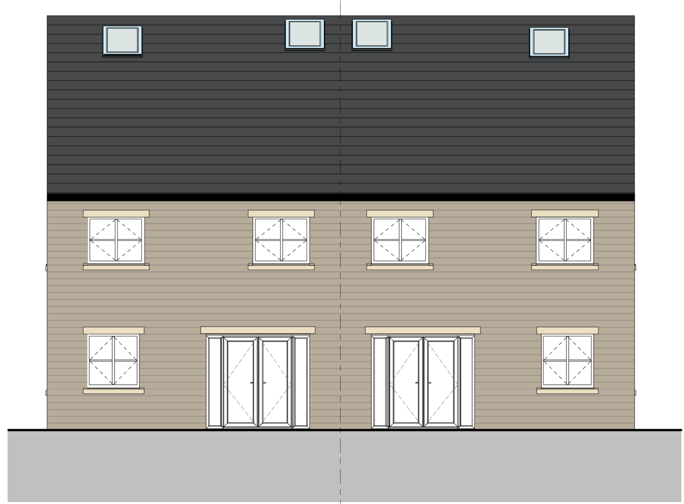
3 Rear Elevation 1 : 50