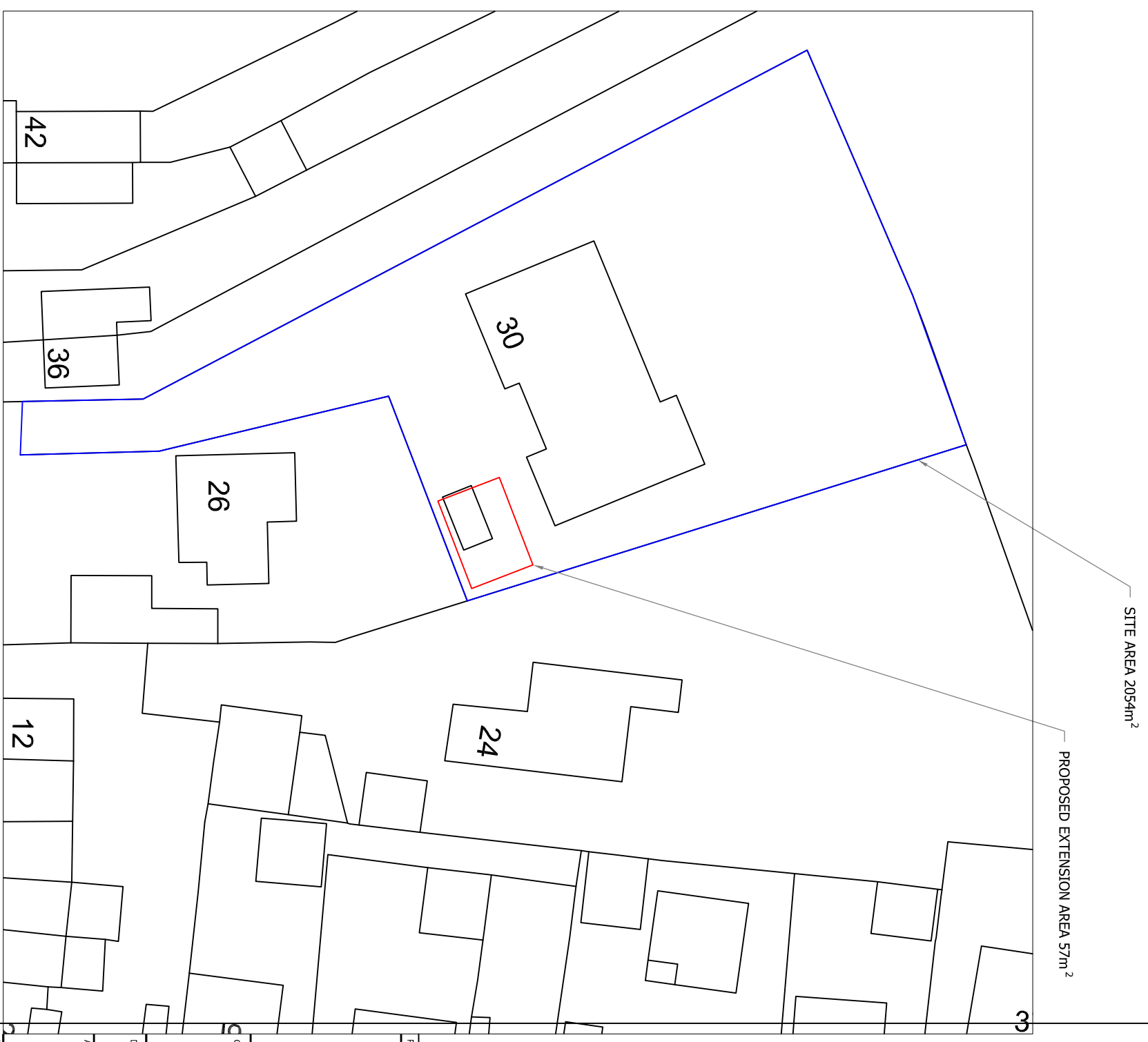
SITE PLAN SCALE 1:500 AT A3