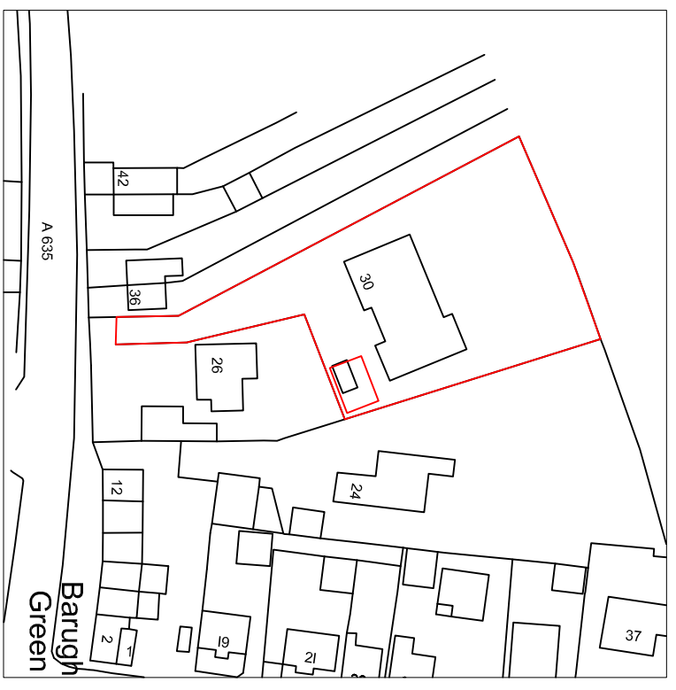
LOCATION PLAN SCALE 1:1250 AT A3