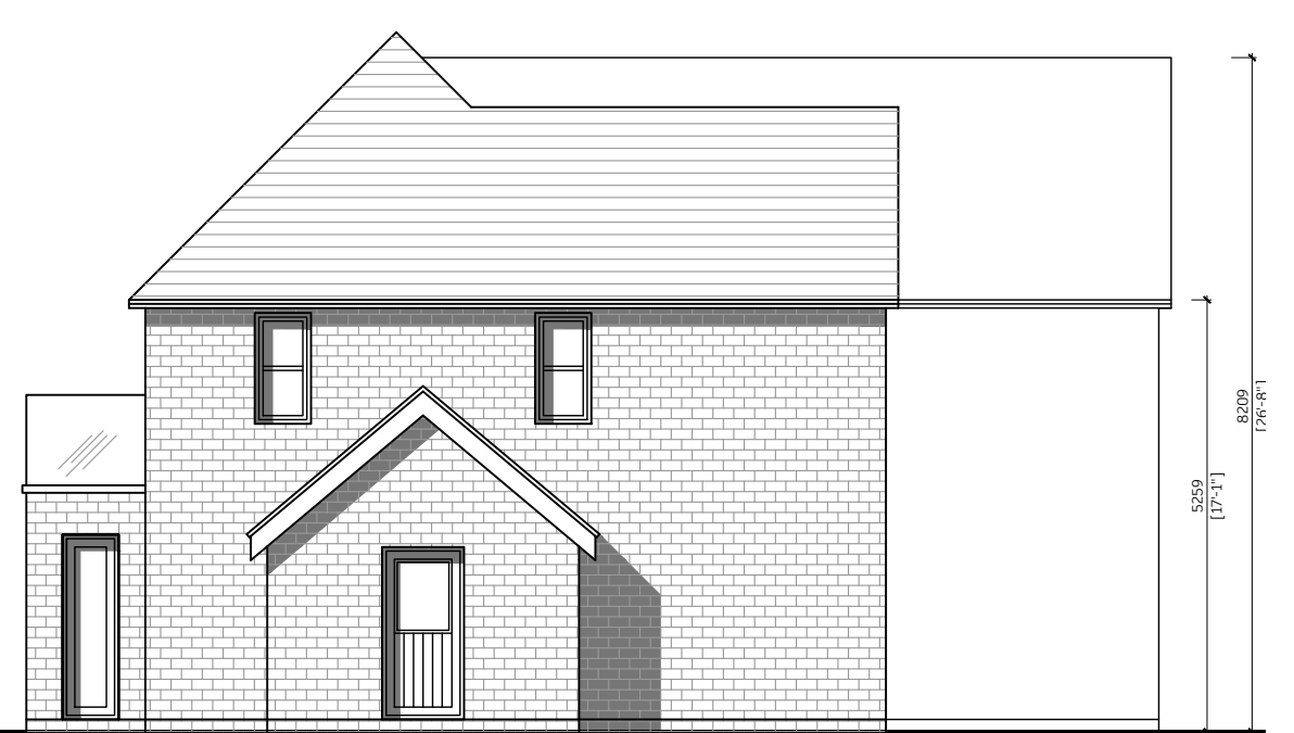
Side Elevation (East)