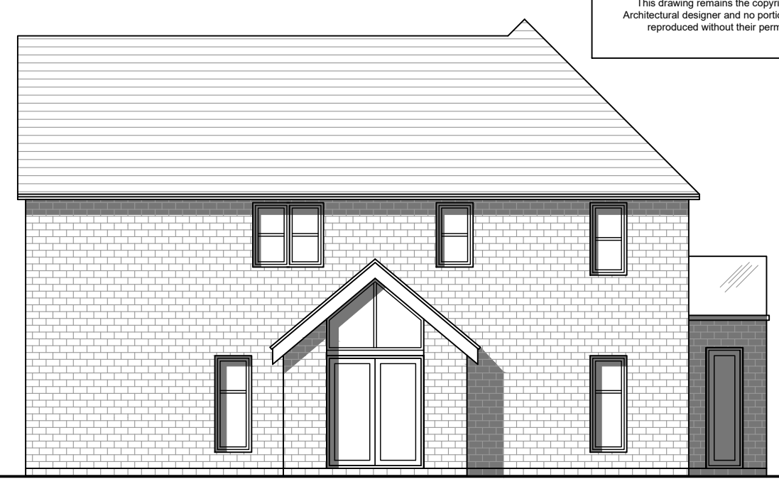
Side Elevation (West)