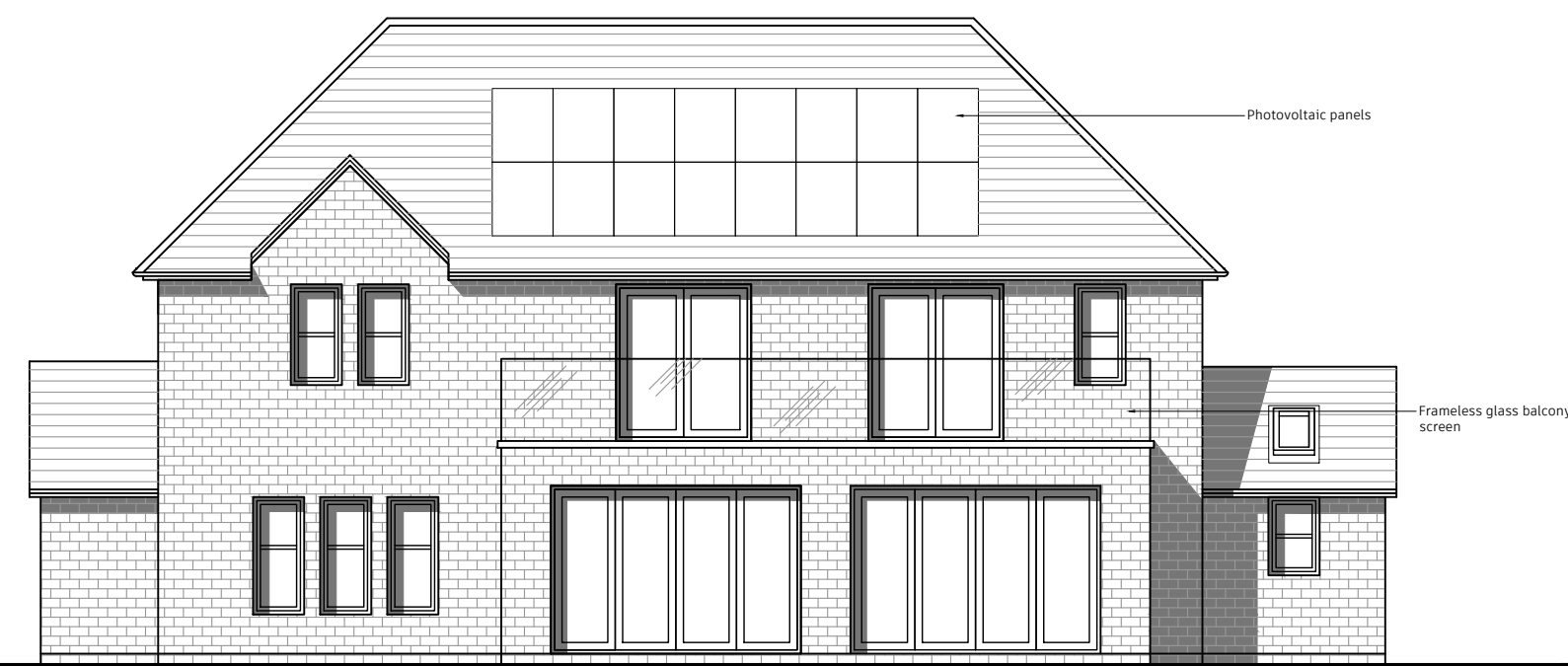
Rear Elevation (South)