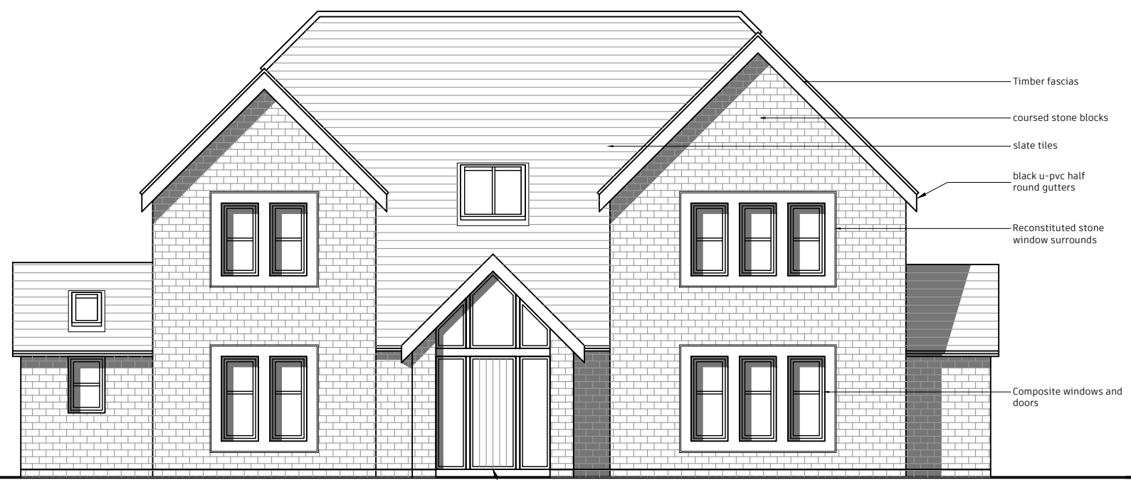
Front Elevation (North)

These drawings are for planning or building regulation purposes only and not to be used as construction drawings other than for guidance. All dimensions to be checked on site prior to construction This drawing remains the copyright of the Architectural designer and no portion should be reproduced without their permission.