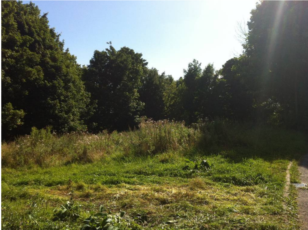
Fig 7. View into site from Hall Close at NW corner looking south east.