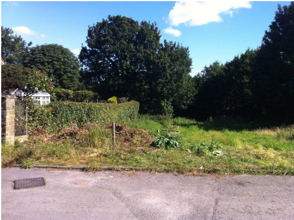
Fig 6. View of northern boundary on right, looking east from Hall Close.