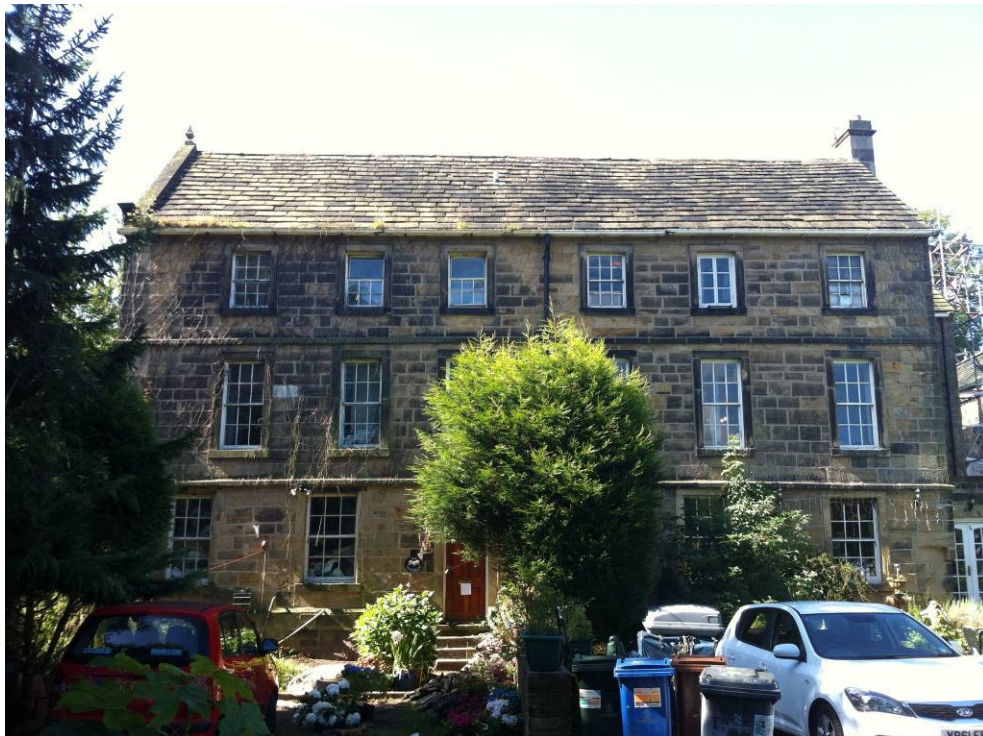
Fig 4. East Elevation of East Wing of Worsbrough Hall.