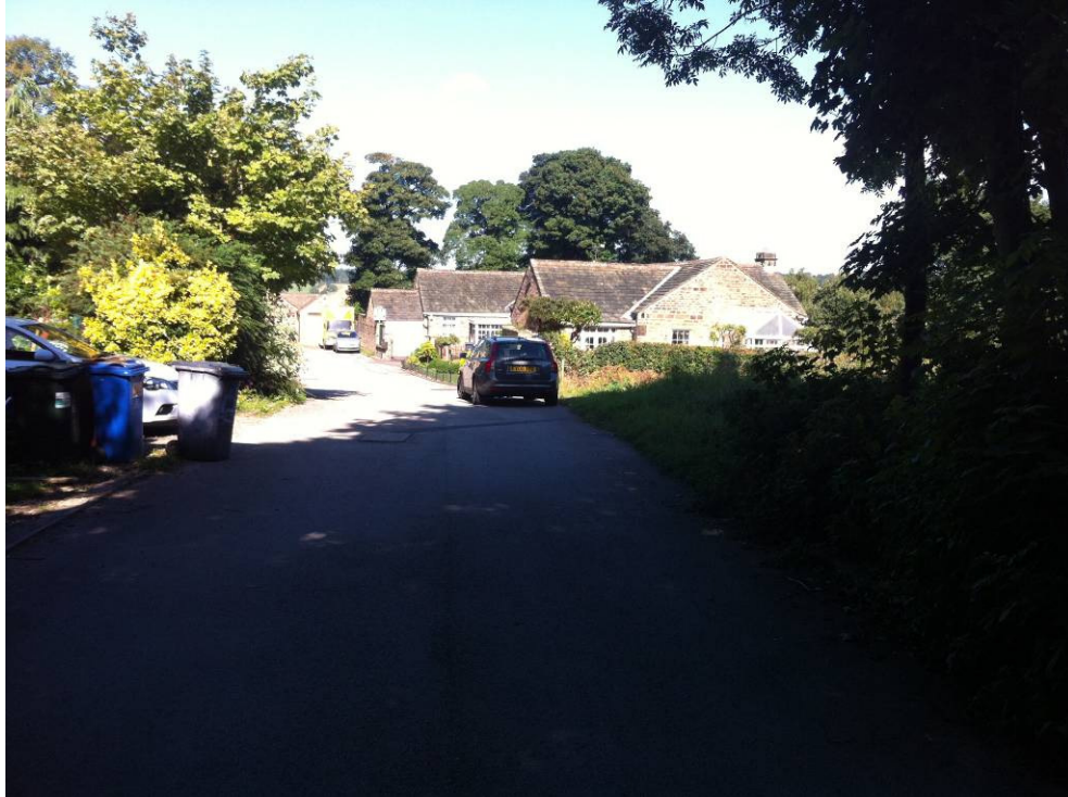
Fig 3. View of Hall Close looking north with site on right hand side.