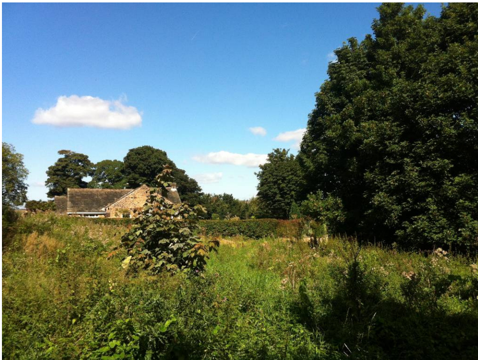
Fig 8. View of site looking north with bungalow beyond northern boundary.