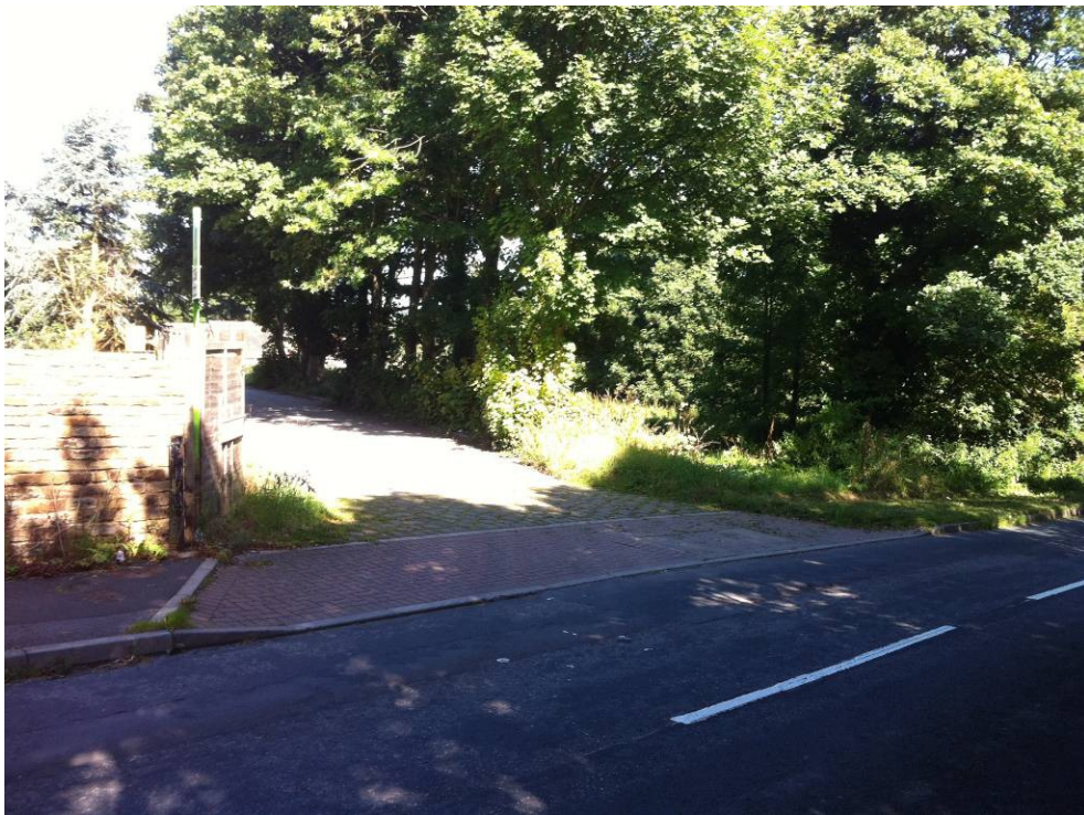
Fig 2. Access to Hall Close from Worsbrough Road.