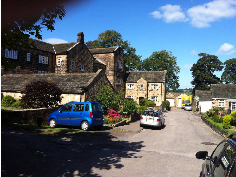
Fig 5. View from Hall Close looking north to development beyond site.