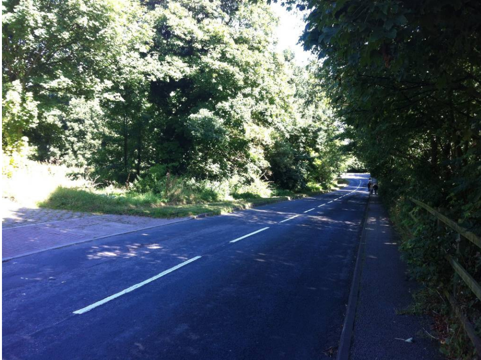
Fig 1. View of Worsbrough Road from access to Hall Close looking east.