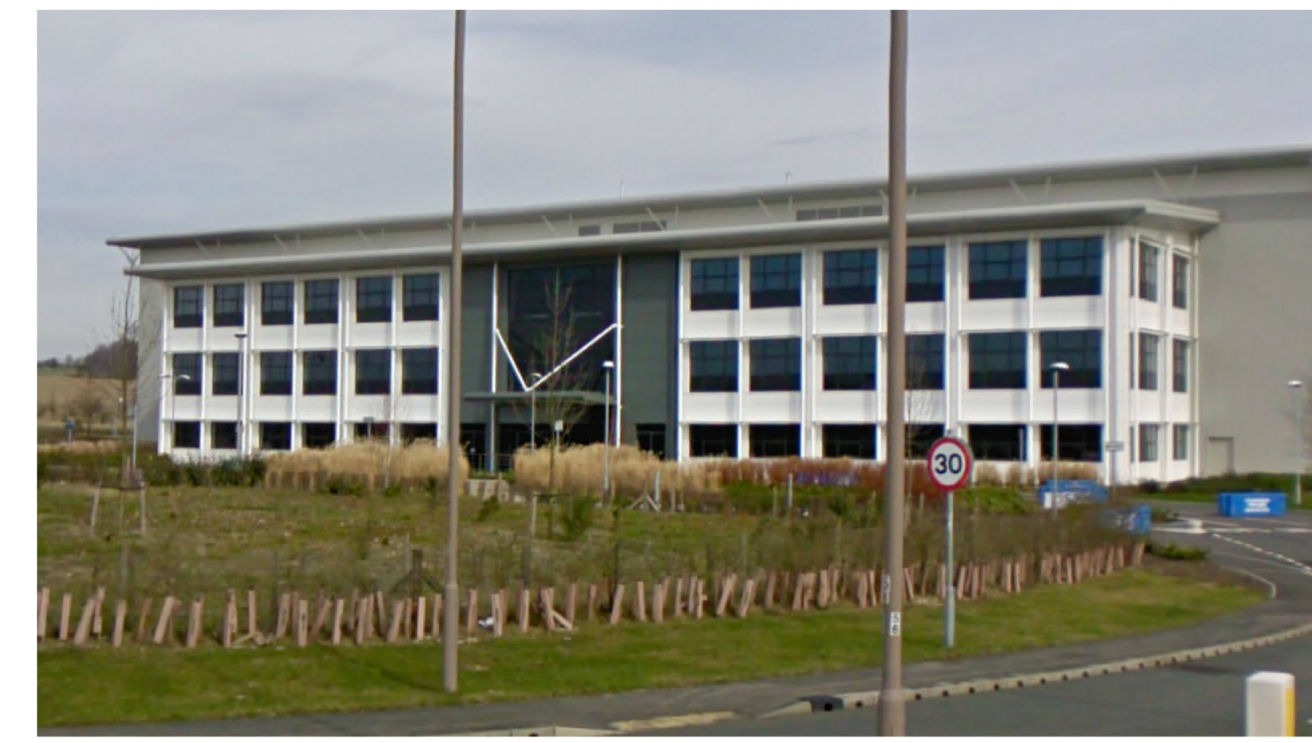
ASOS office opposite site