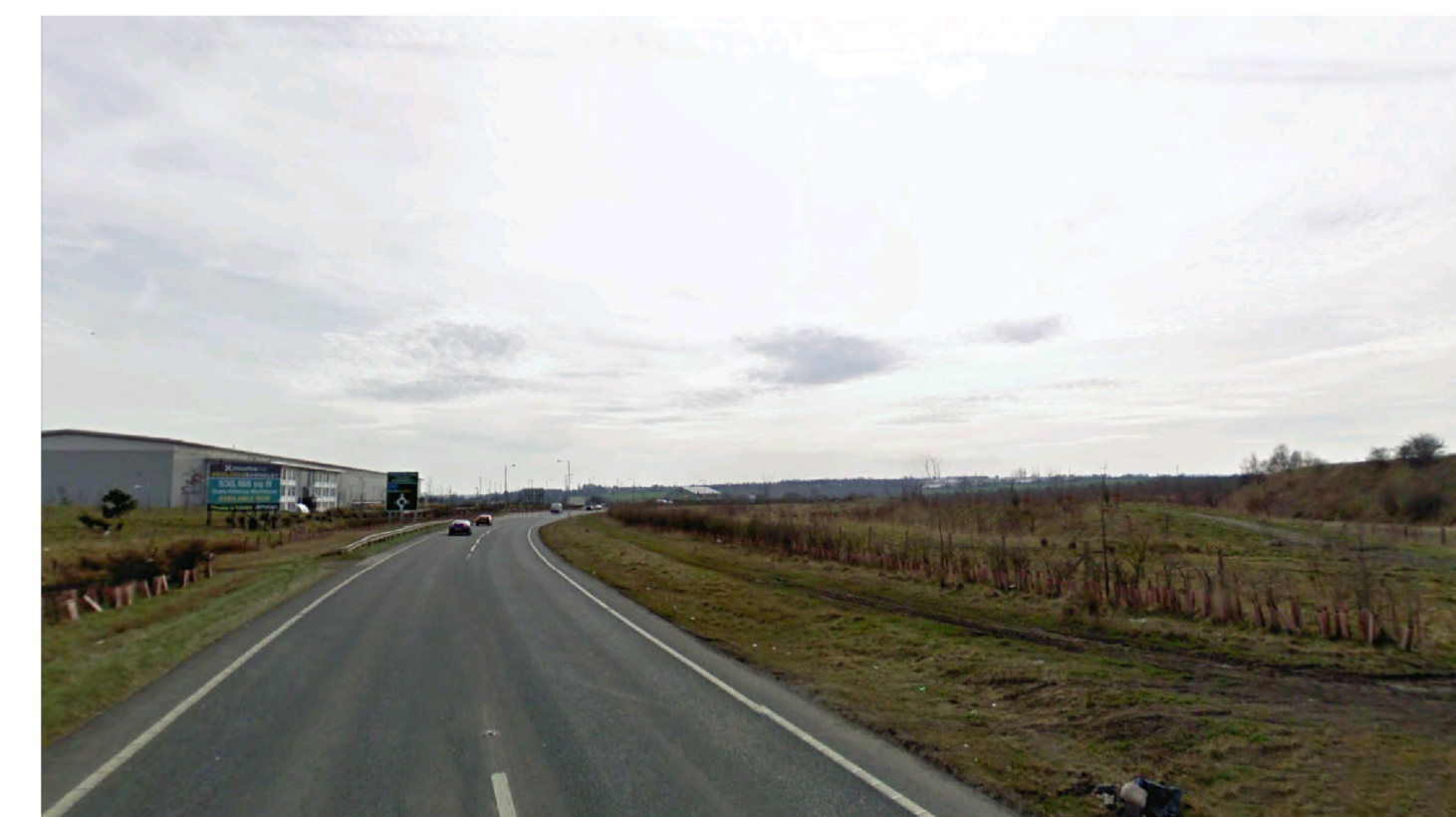
Site from north east