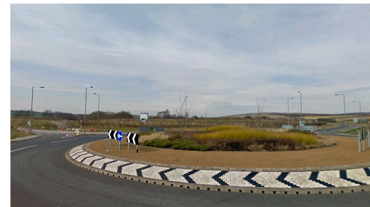
Site from south east