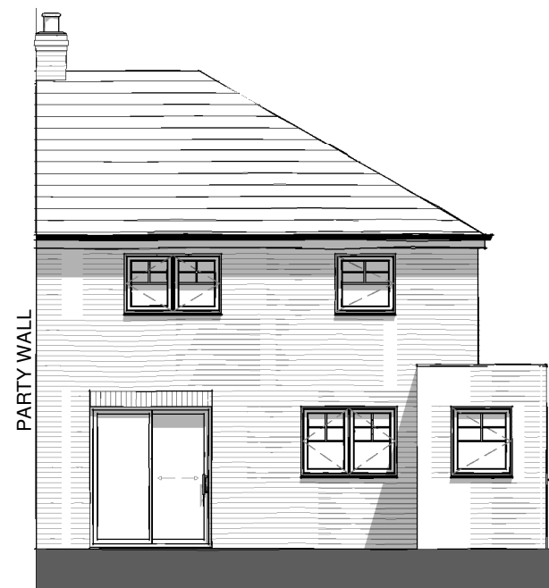
Rear Elevation. 1 : 100