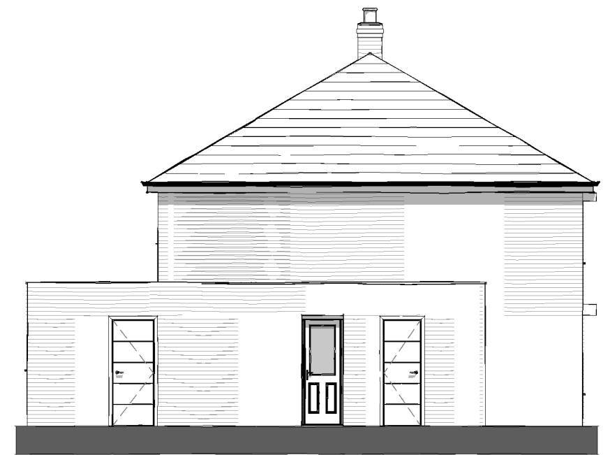
Left Side Elevation. 1 : 100