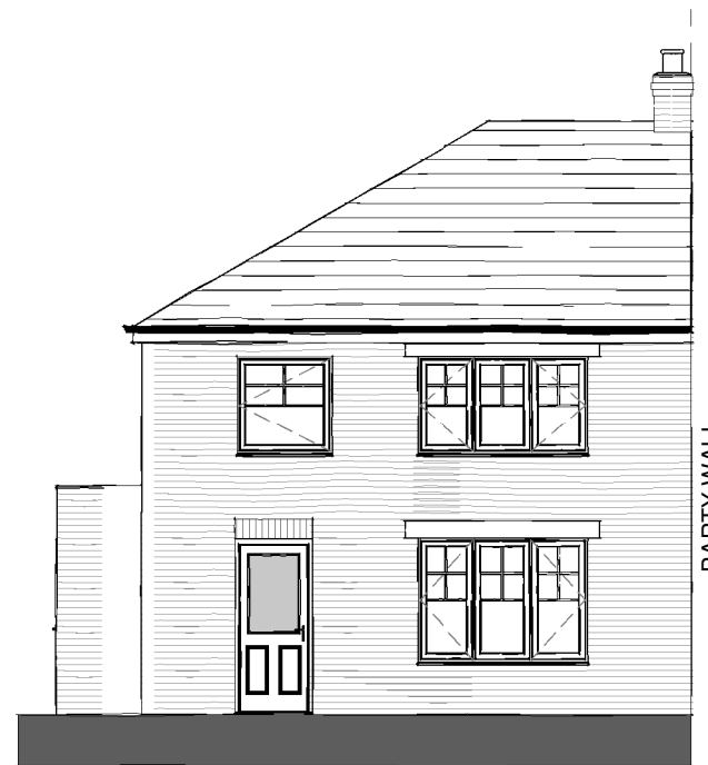
Front Elevation. 1 : 100