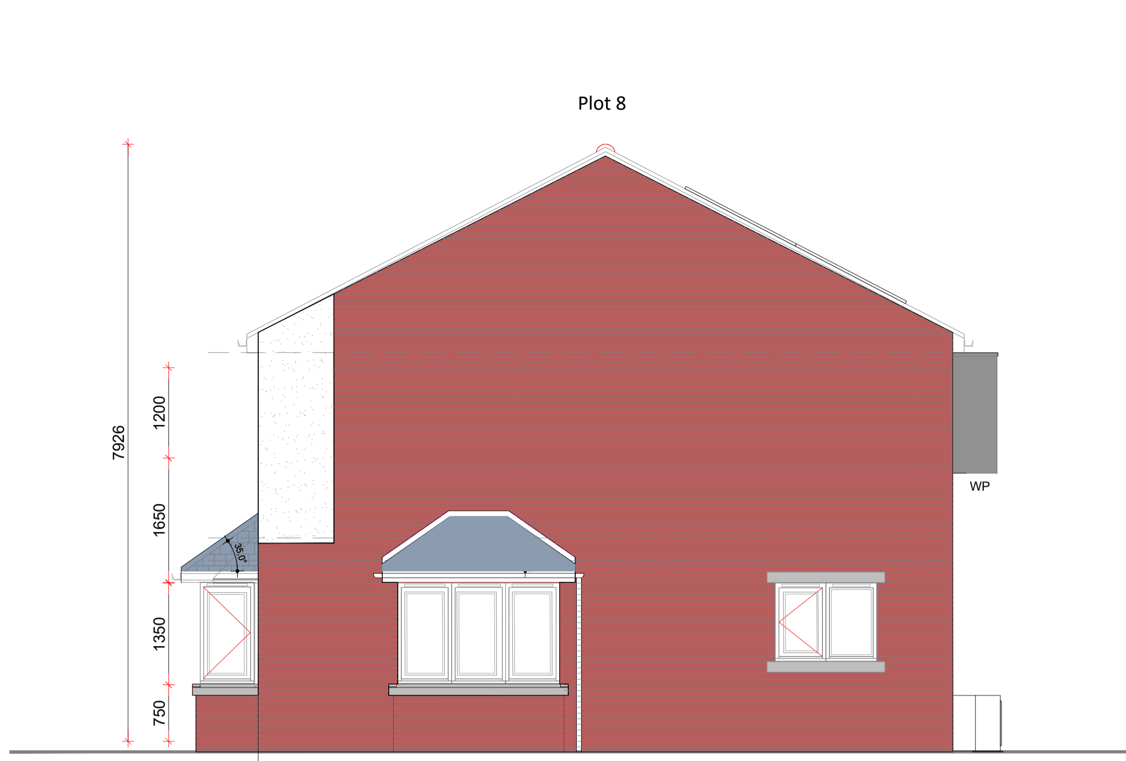
NORTH WEST FACING (SIDE) ELEVATION - PLOT 8