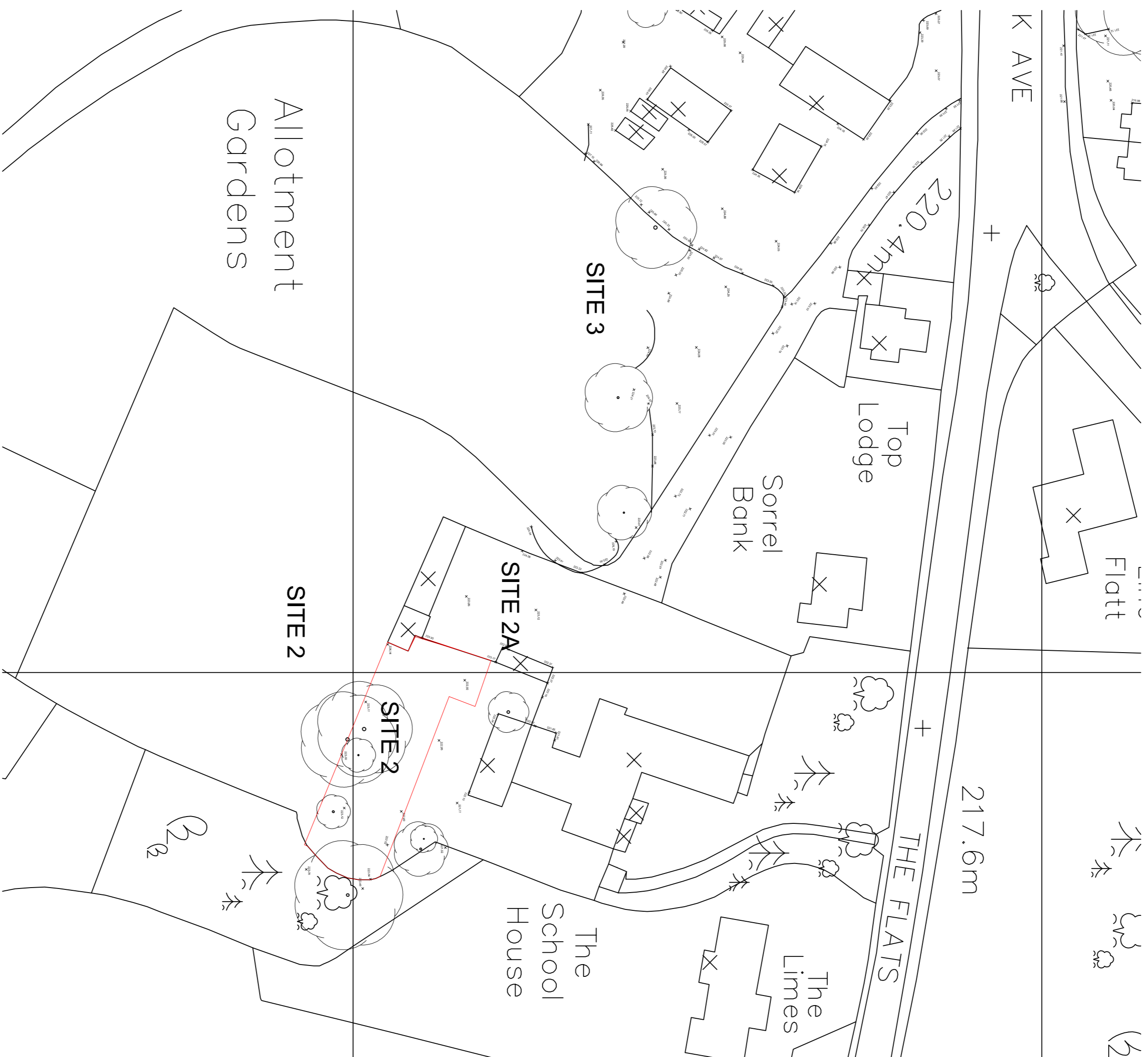
LAYOUT AS EXISTING 1:500

This Contract is to carry out the work in compliance with the Building Regulations, relevant current British Standards