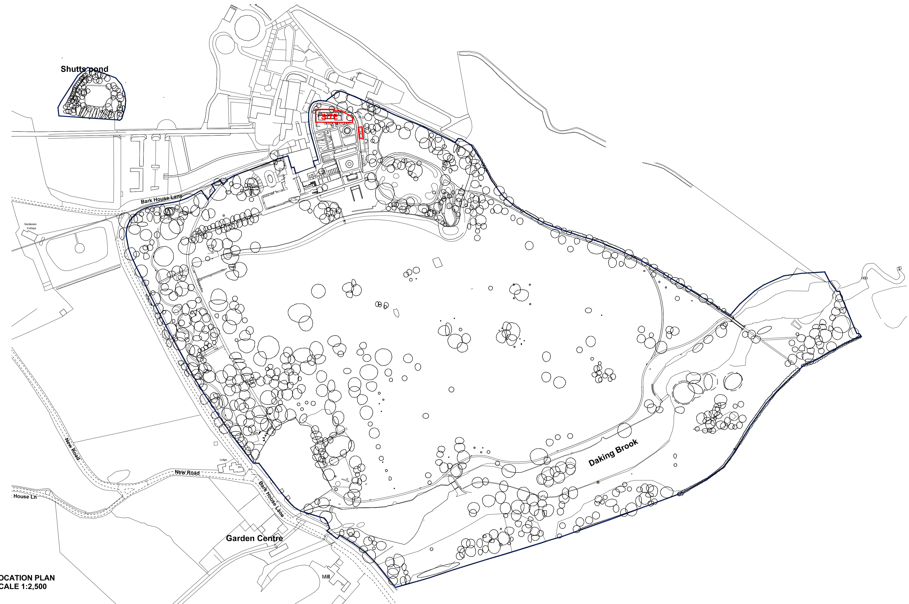
LOCATION PLAN SCALE 1:2,500