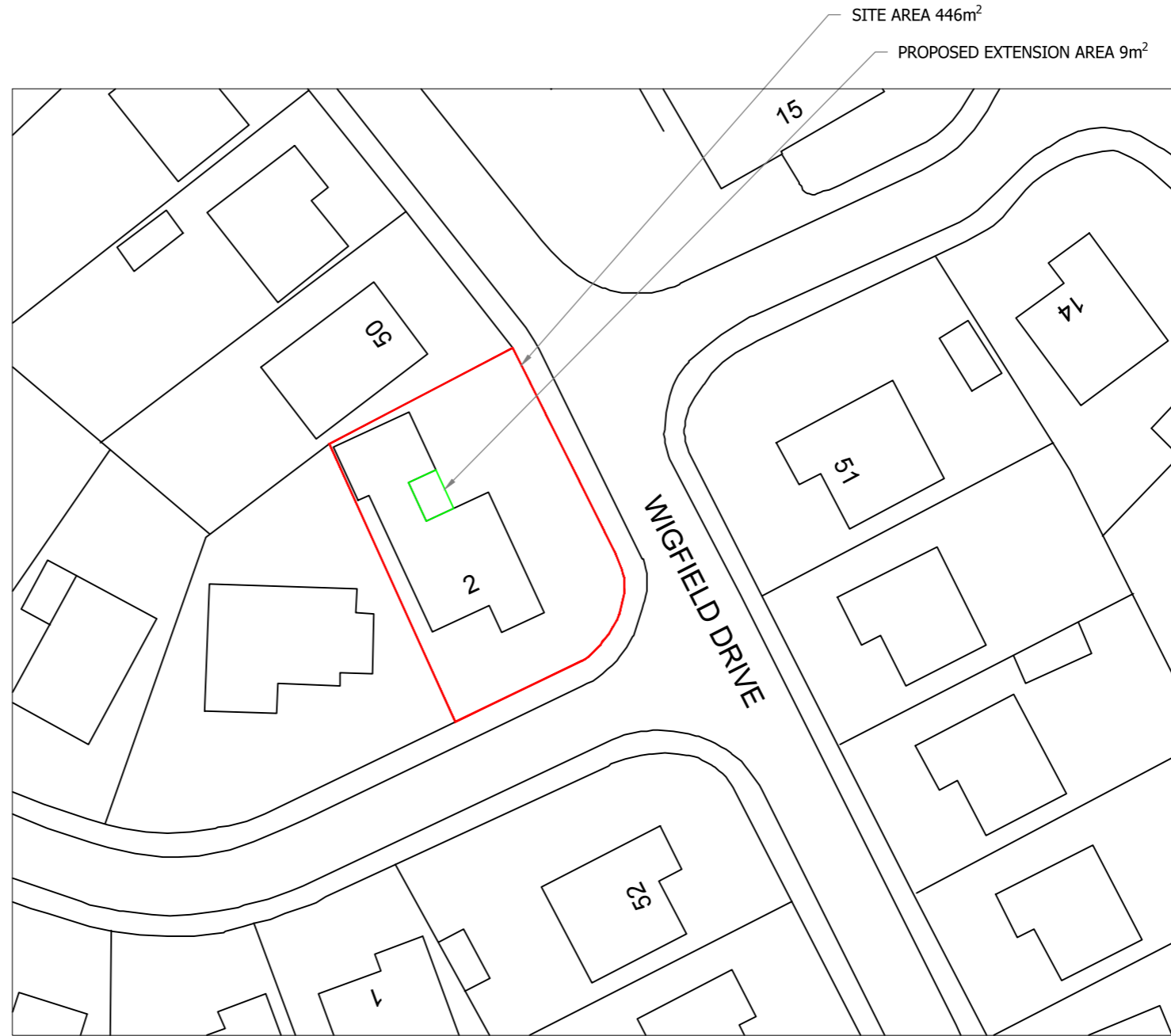
SITE PLAN SCALE 1:500 AT A3