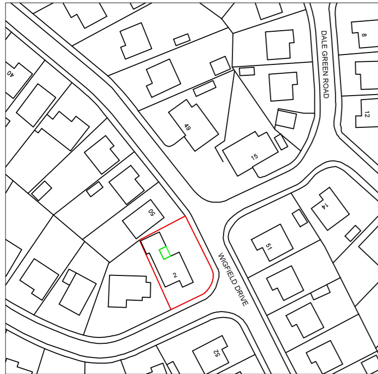
LOCATION PLAN SCALE 1:1250 AT A3