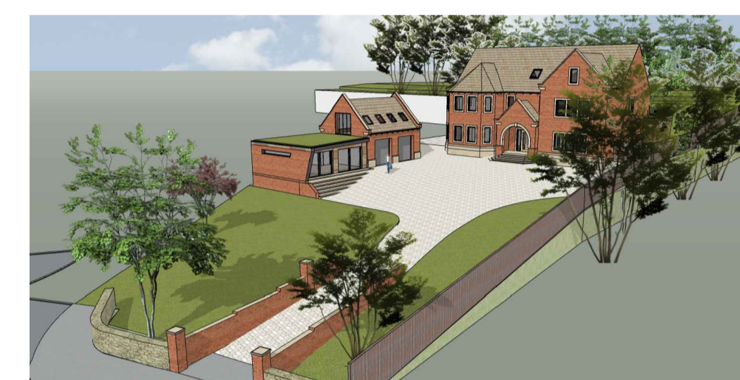
SITE PERSPECTIVE VIEWS