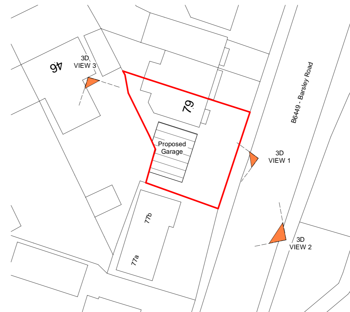
3D View Locations