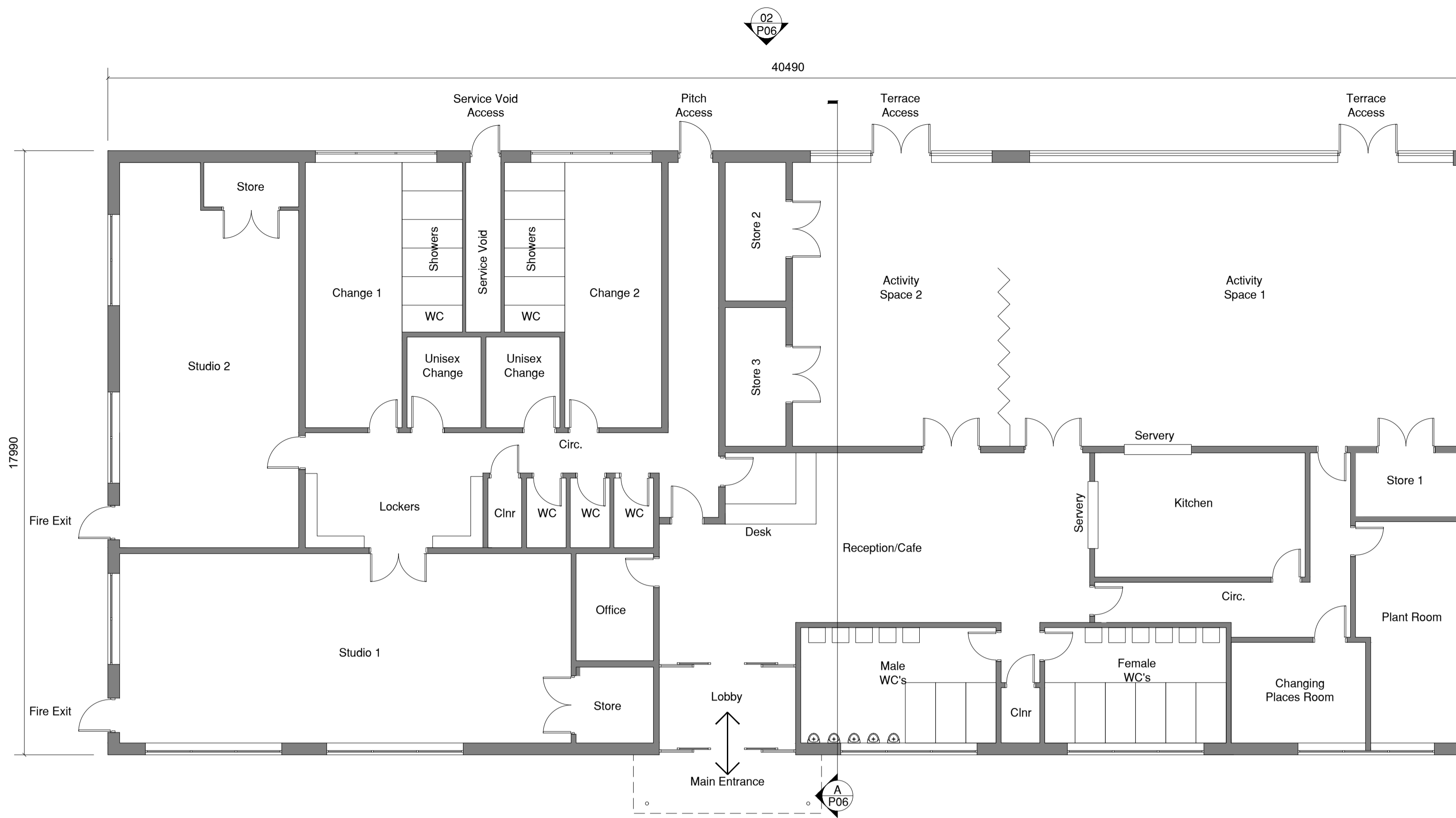
01 Proposed Floor Plan 1:100