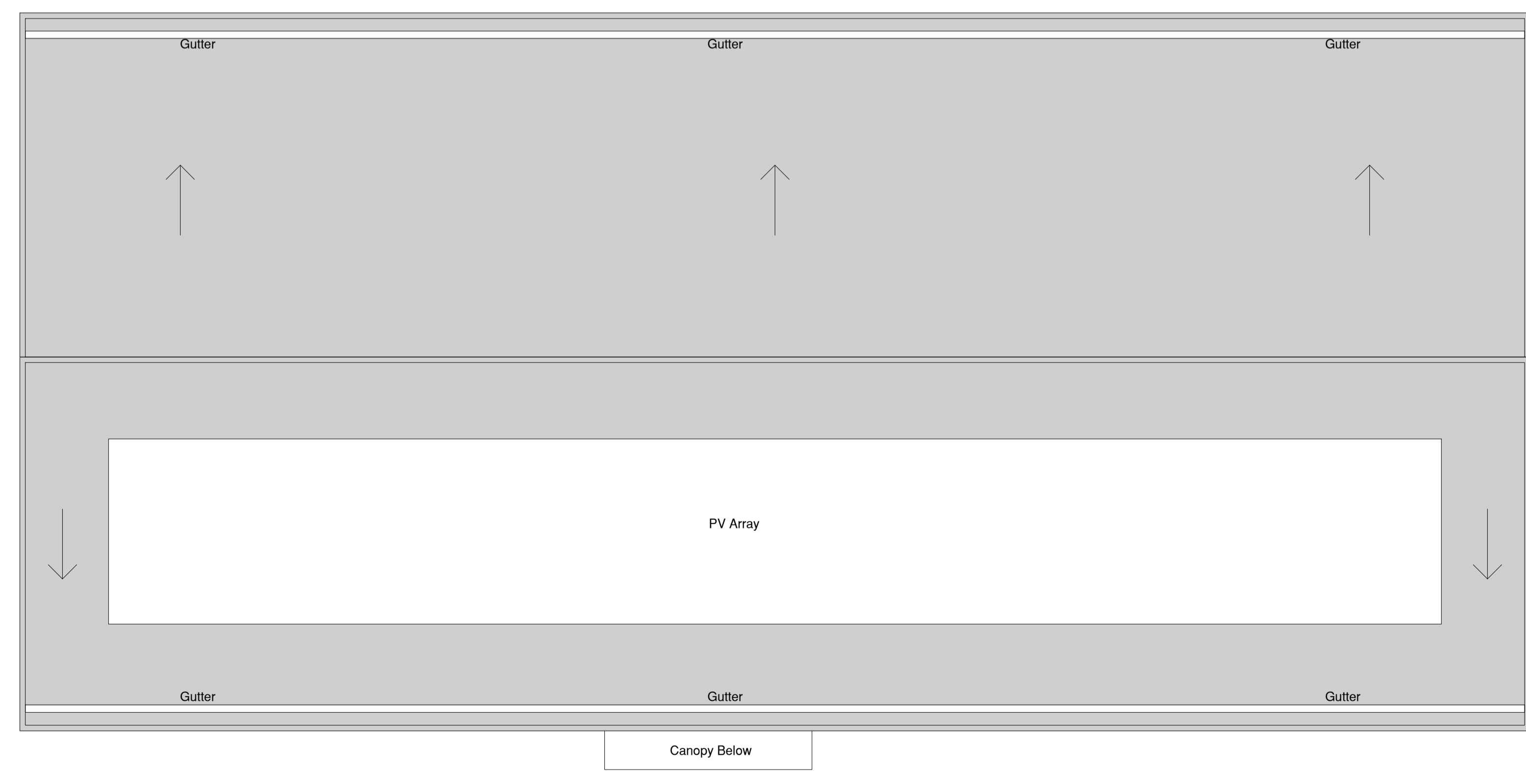
02 Proposed Roof Plan 1:100