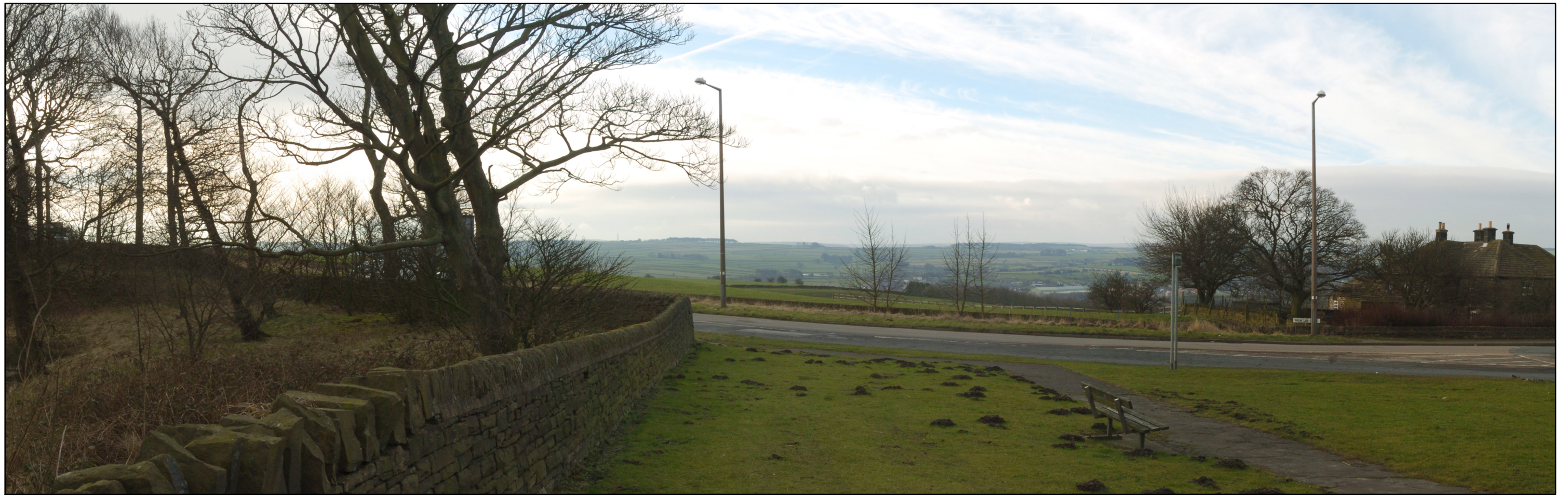
Existing view from viewpoint