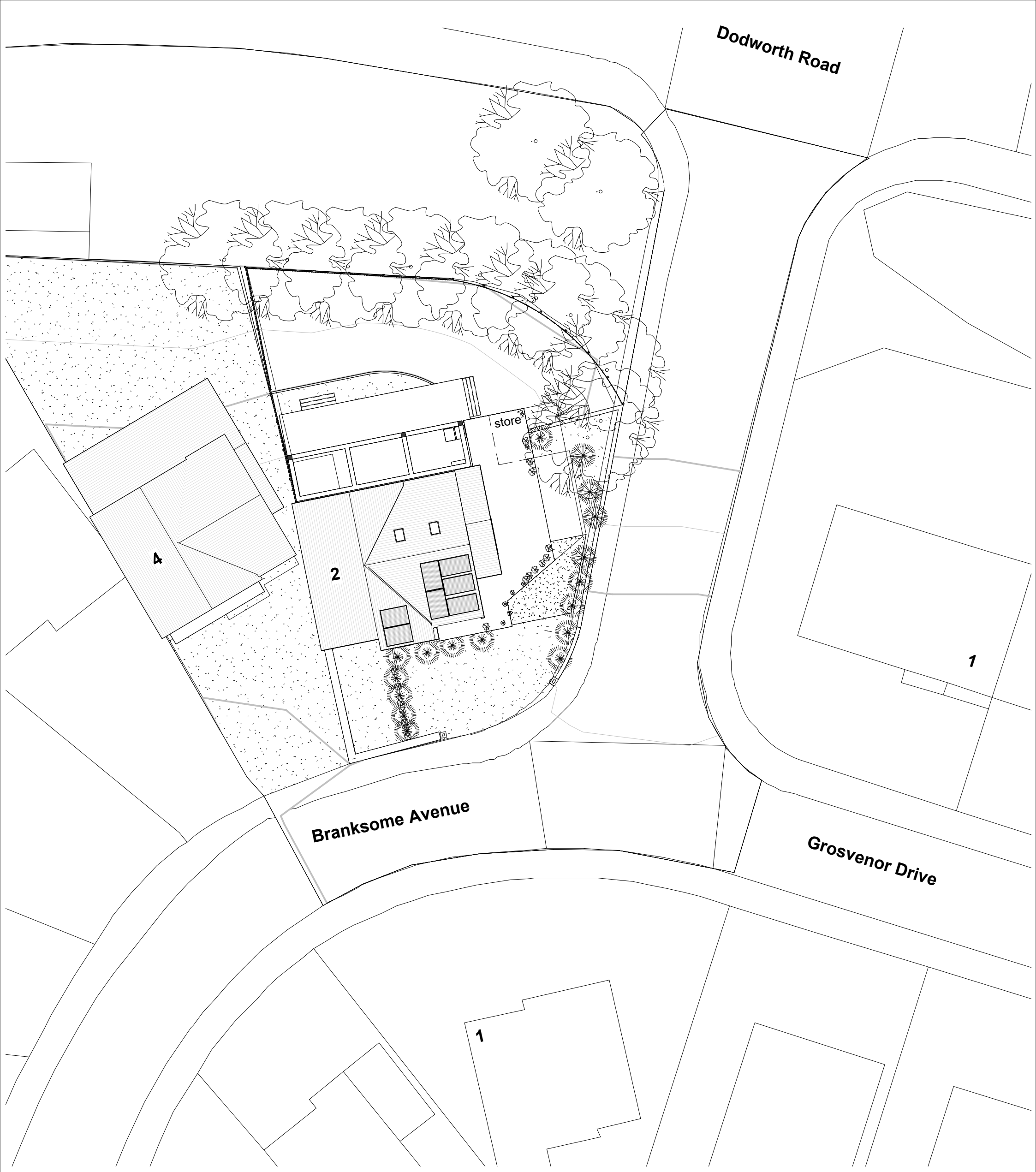
1 Proposed site plan 1 : 200