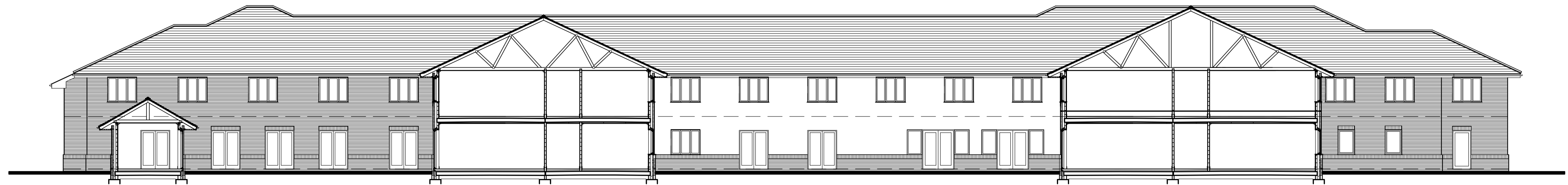
Proposed North Elevation (Elevation 2)