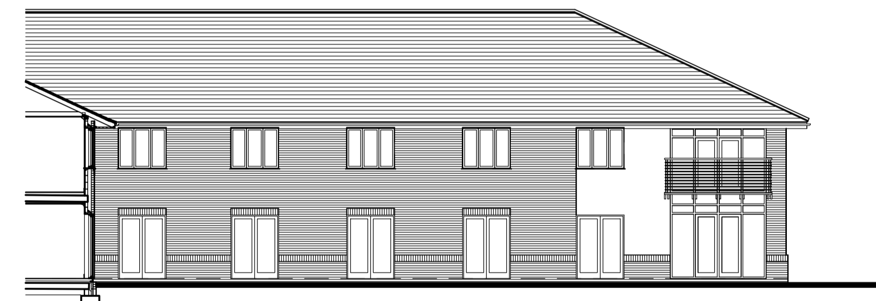
Proposed East Elevation (Elevation 3)