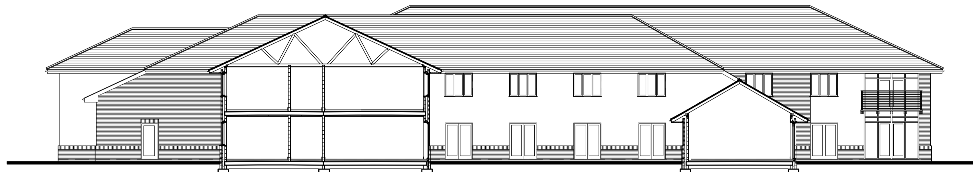
Proposed East Elevation (Elevation 2)