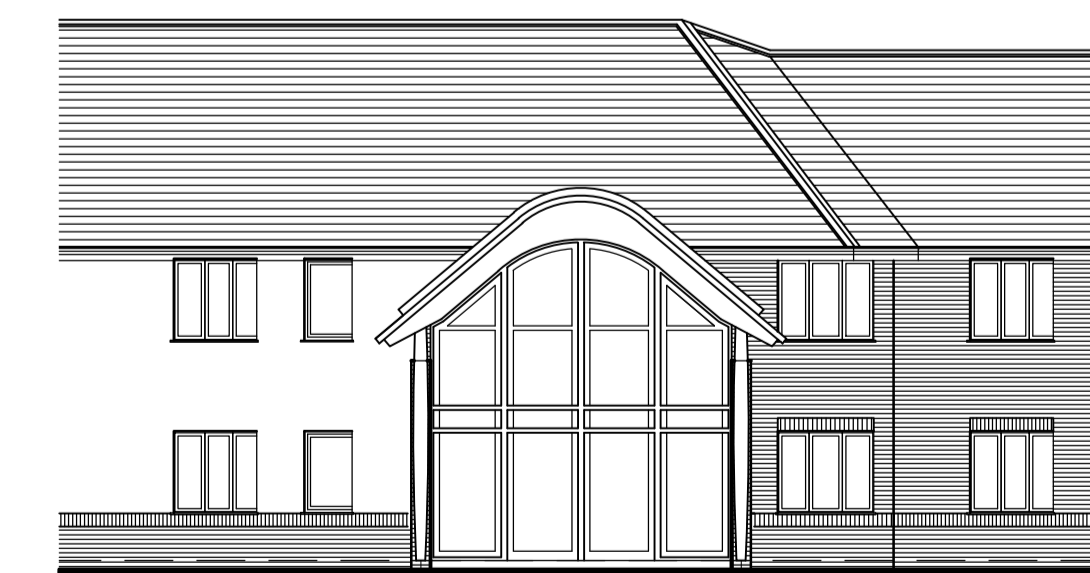
Entrance Lobby South East Elevation 1