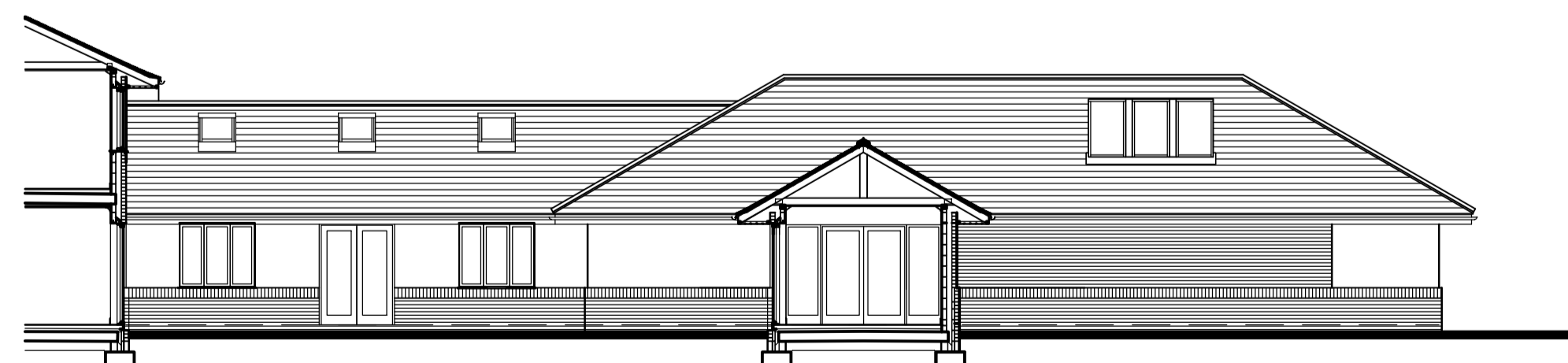
Proposed South Elevation (Elevation 2)