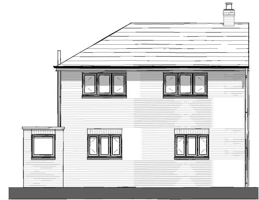
Rear Elevation. 1 : 100