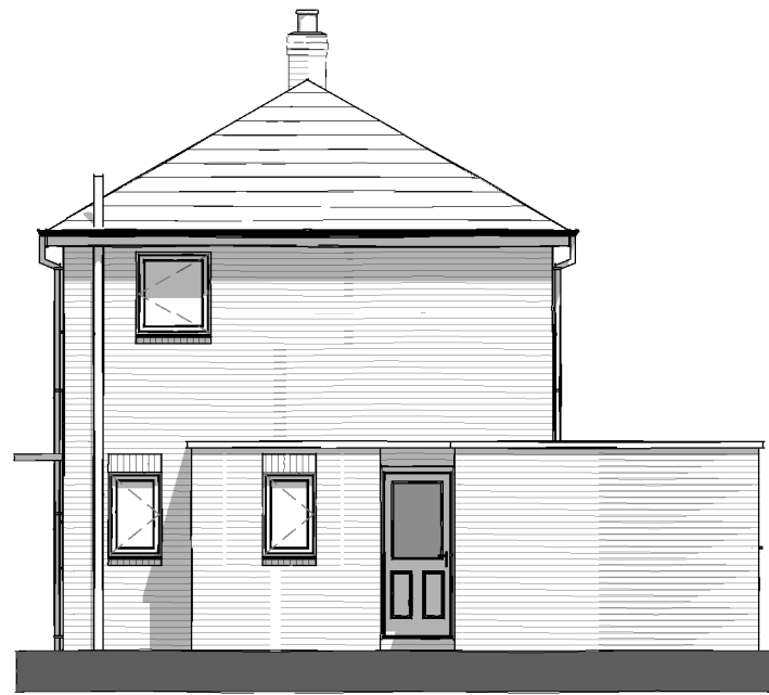
Right Side Elevation. 1 : 100