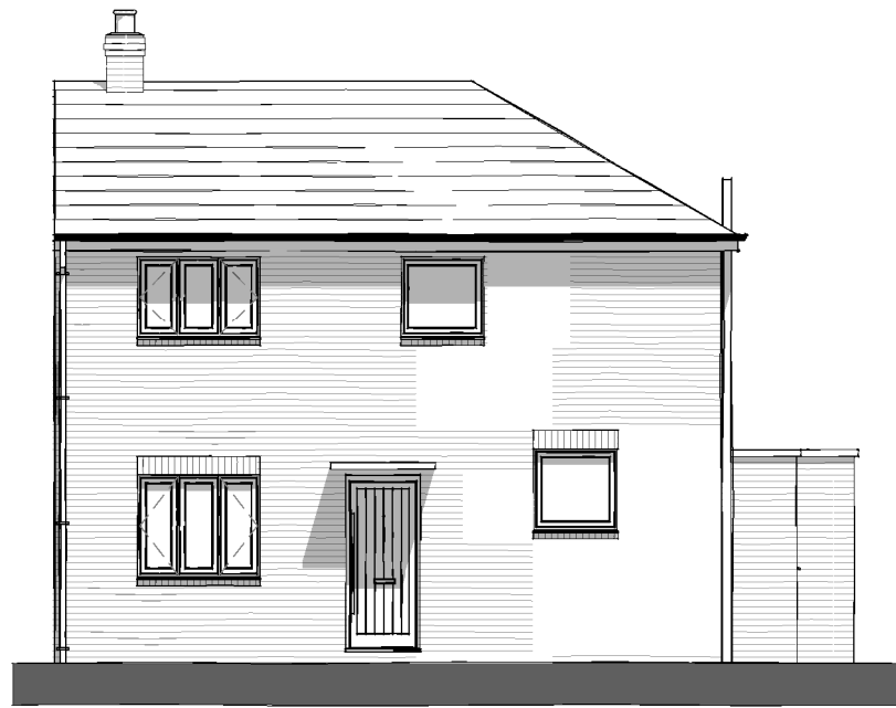
Front Elevation. 1 : 100