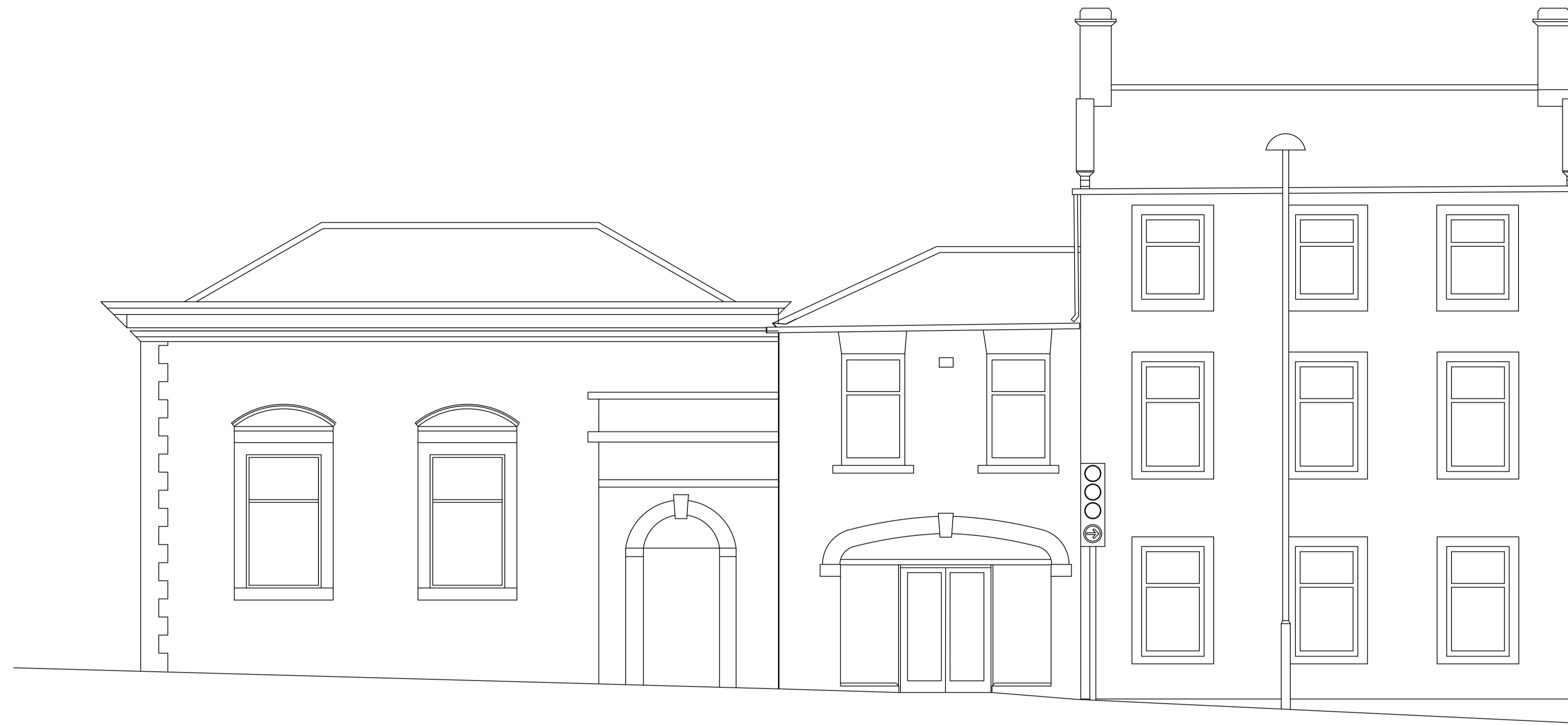
FRONT (WESTERN) ELEVATION