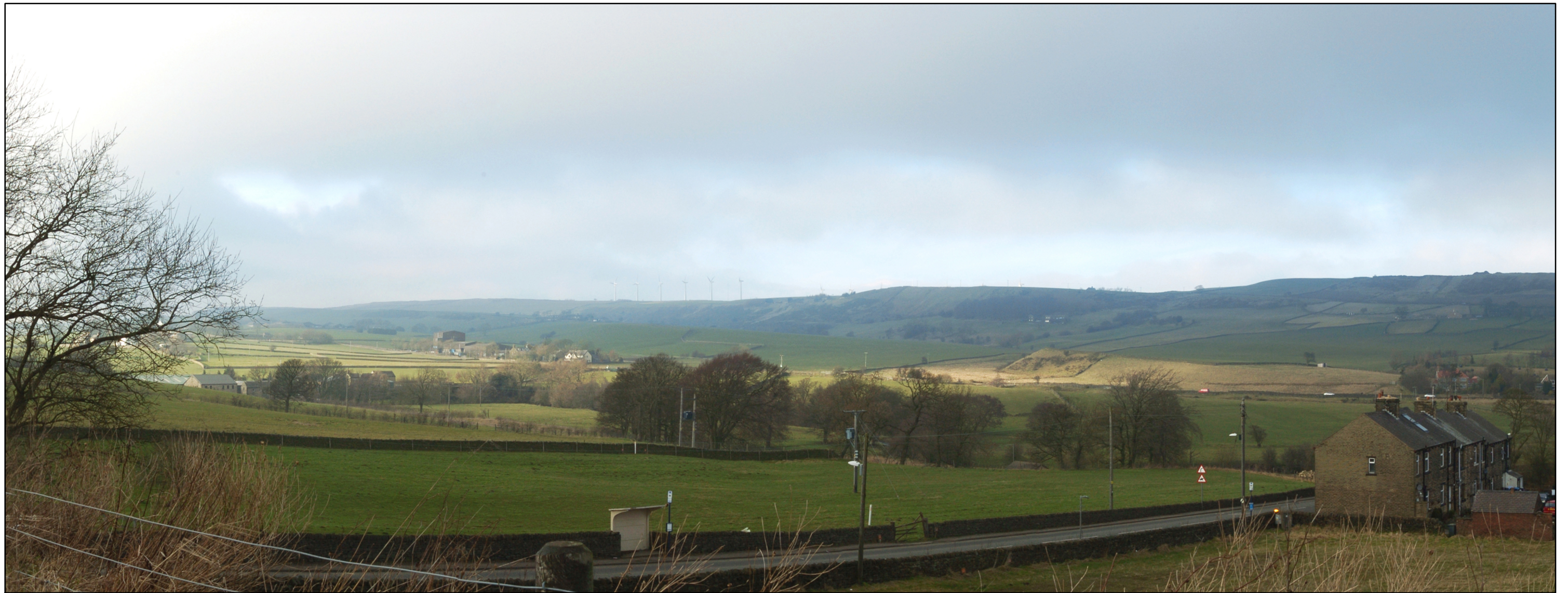
Existing view from viewpoint