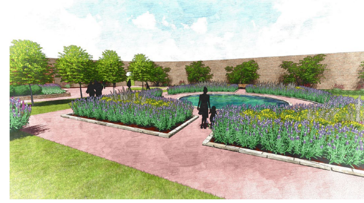
5. Footpath parallel to resorted glasshouse