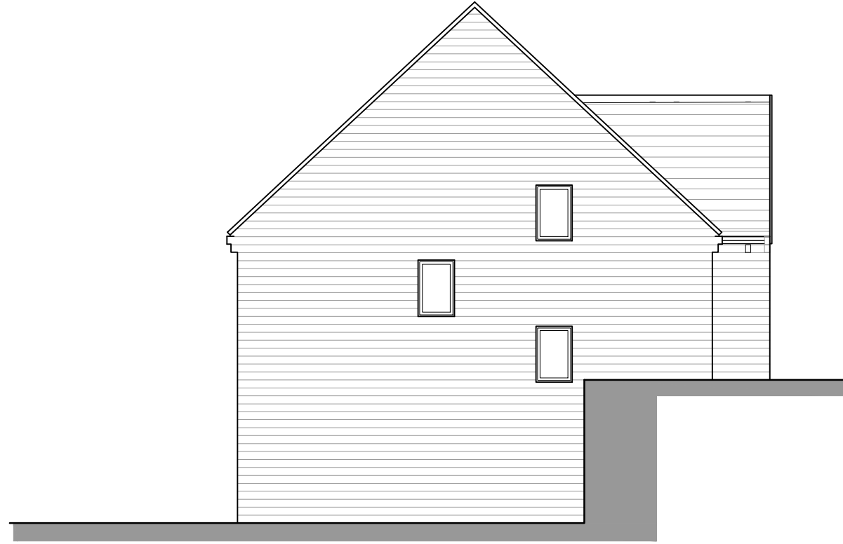
LH SIDE ELEVATION