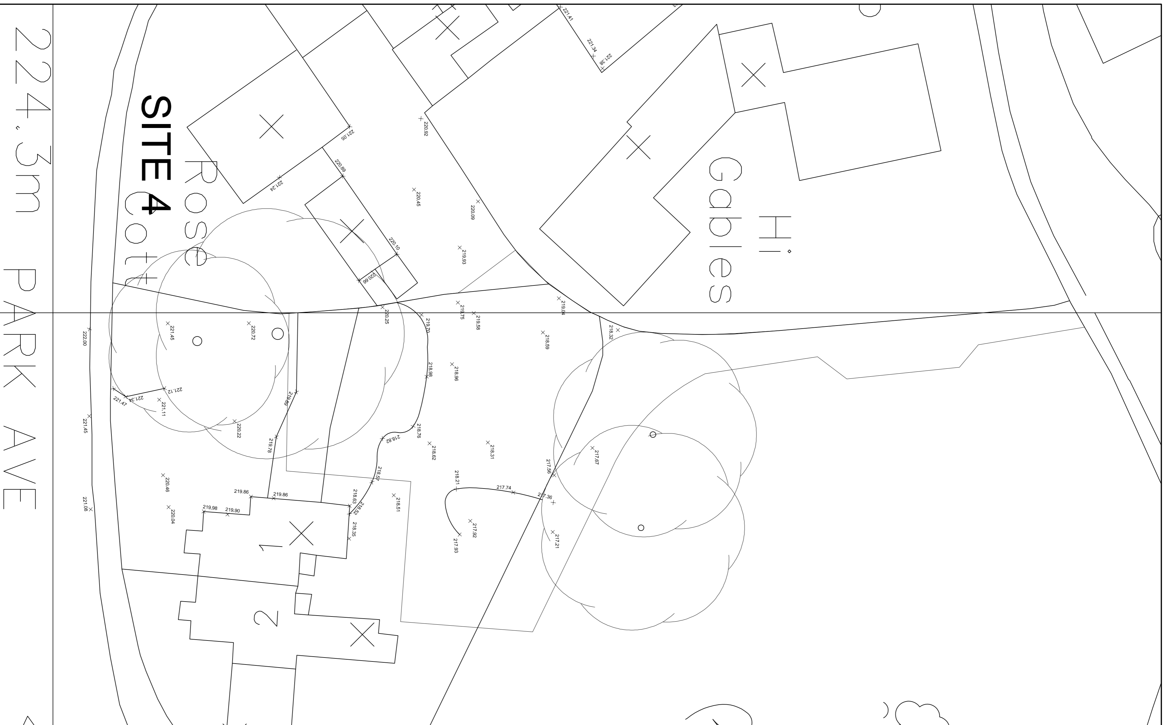
SITE AS EXISTING 1:200