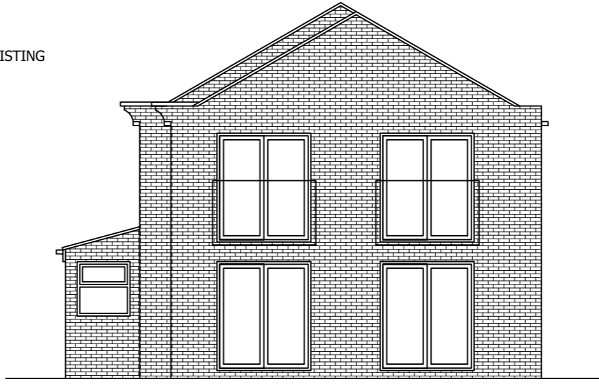
PROPOSED END ELEVATION SCALE 1:100 AT A3