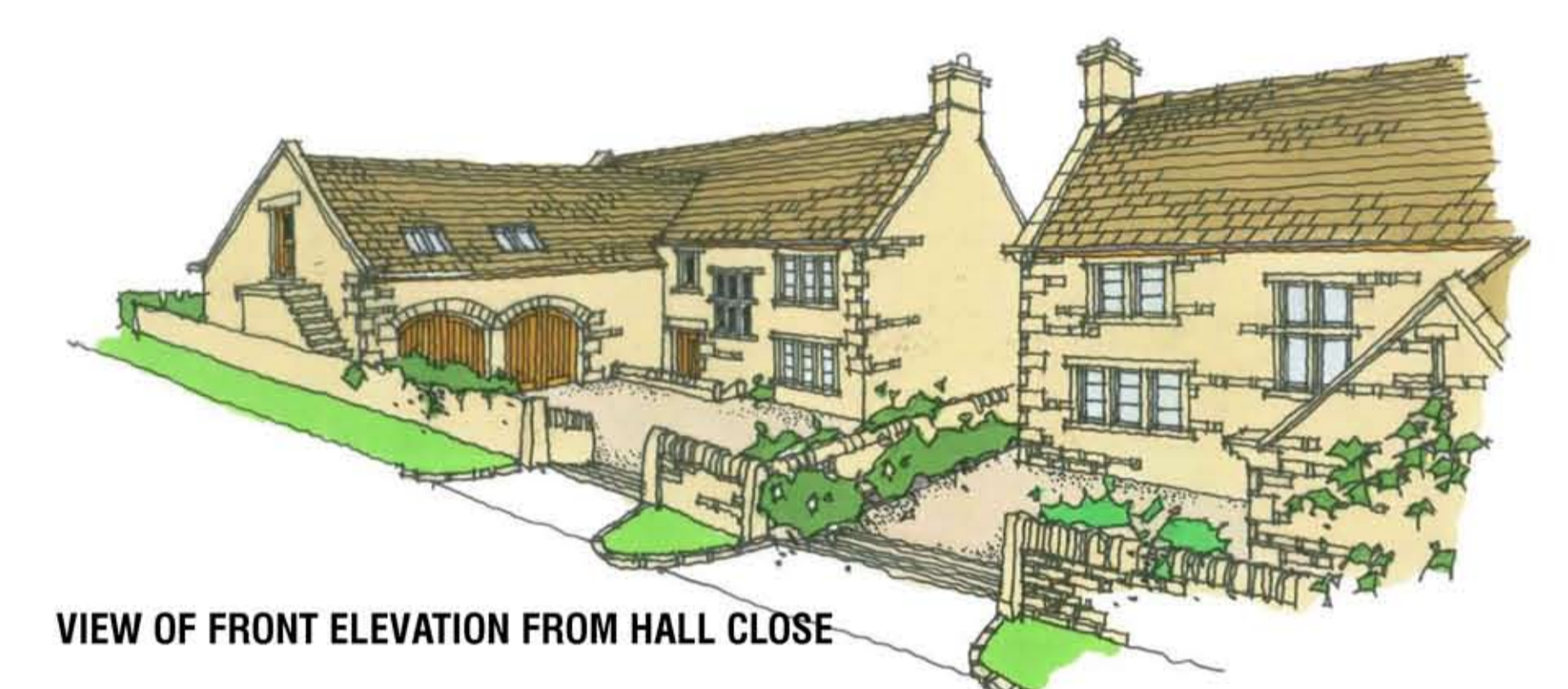
VIEW OF FRONT ELEVATION FROM HALL CLOSE