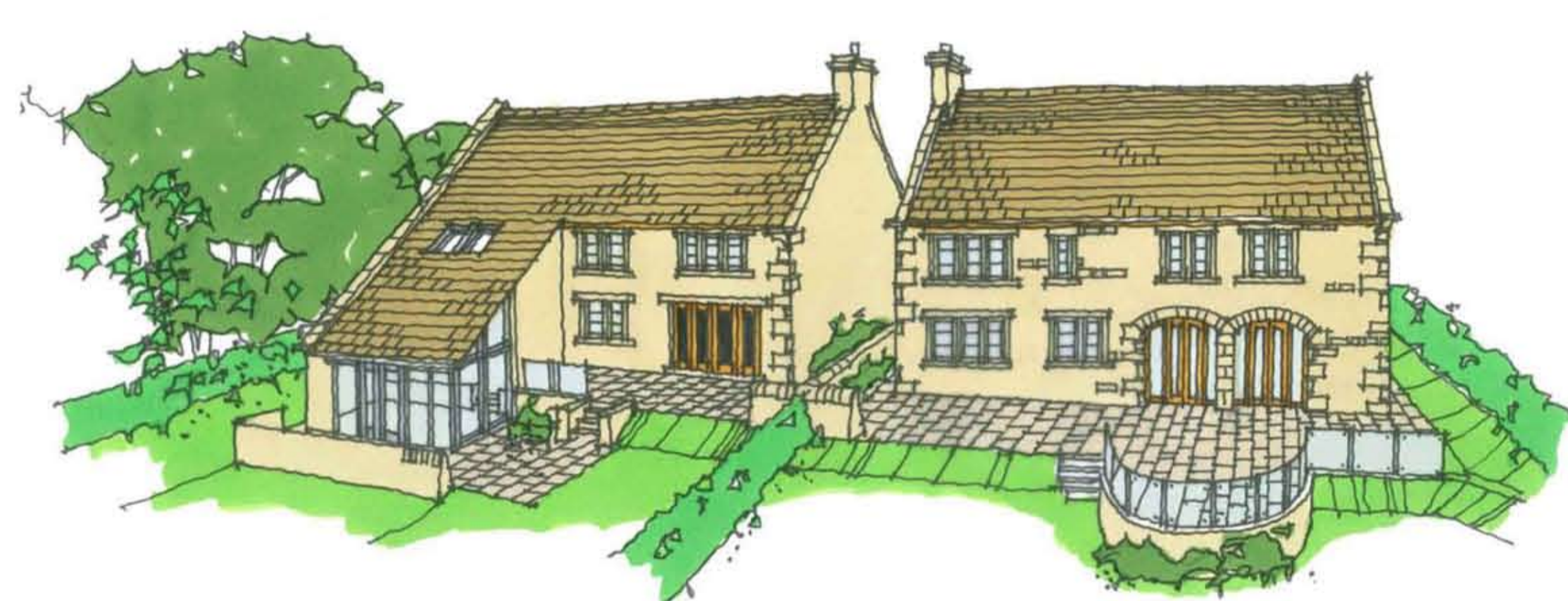
VIEW OF REAR ELEVATION OF PROPOSED DWELLINGS