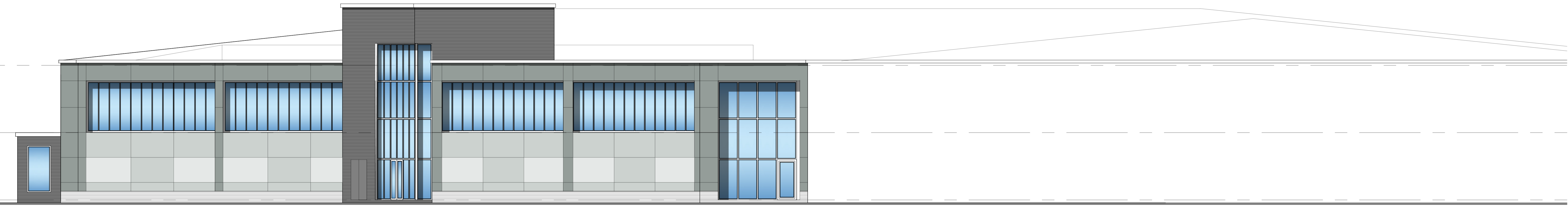
Proposed Side Elevation 1:100@A1