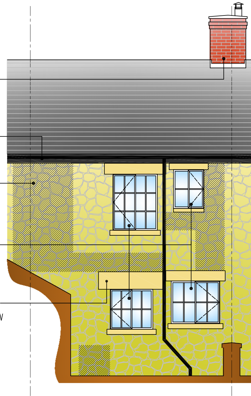
PROPOSED ELEVATION - REAR