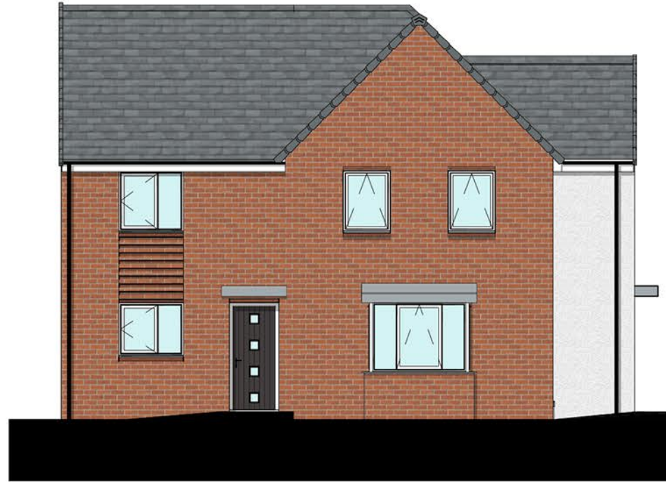
Front Elevation. 1 : 100