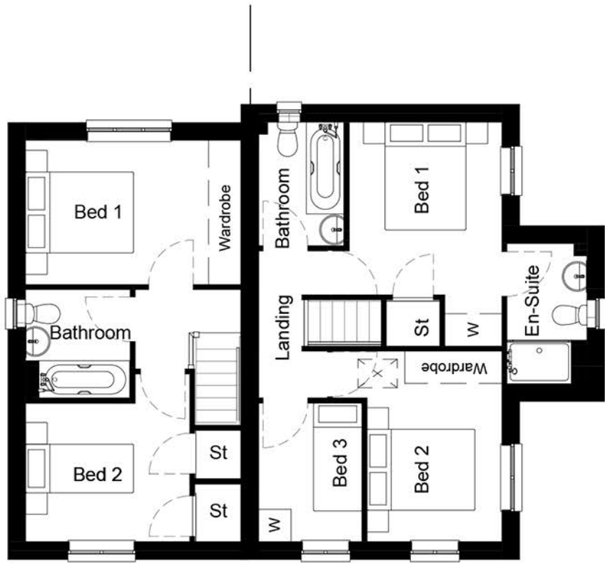
First Floor. 1 : 100