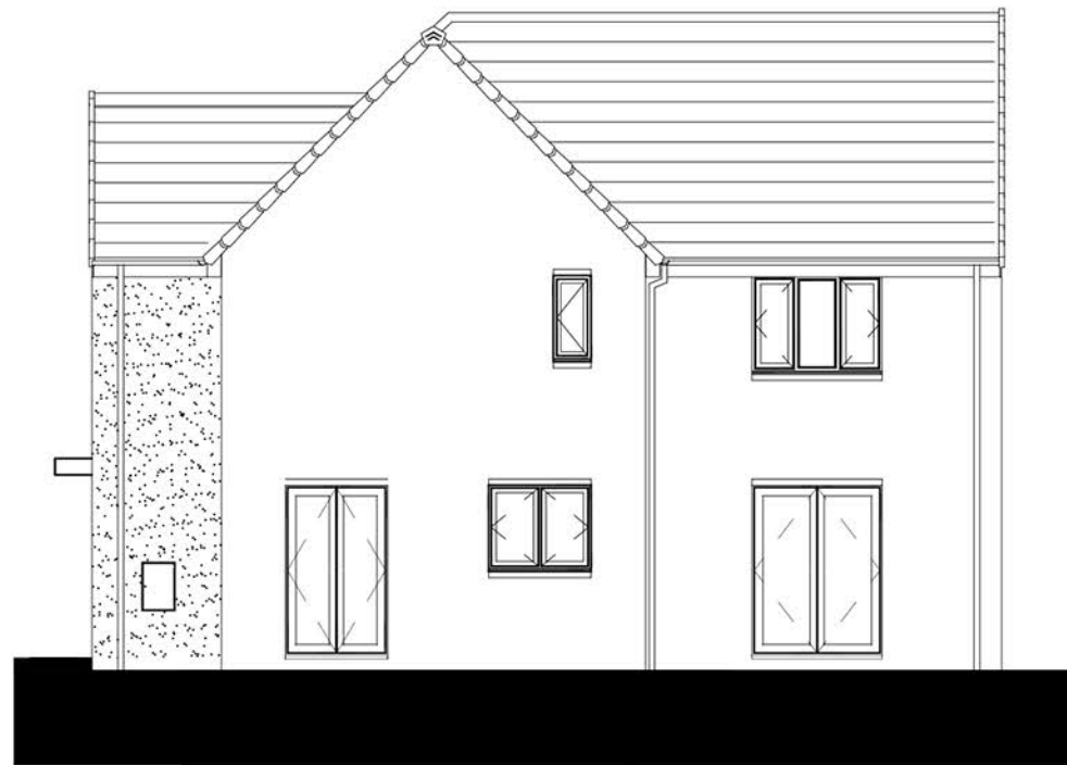
Rear Elevation. 1 : 100