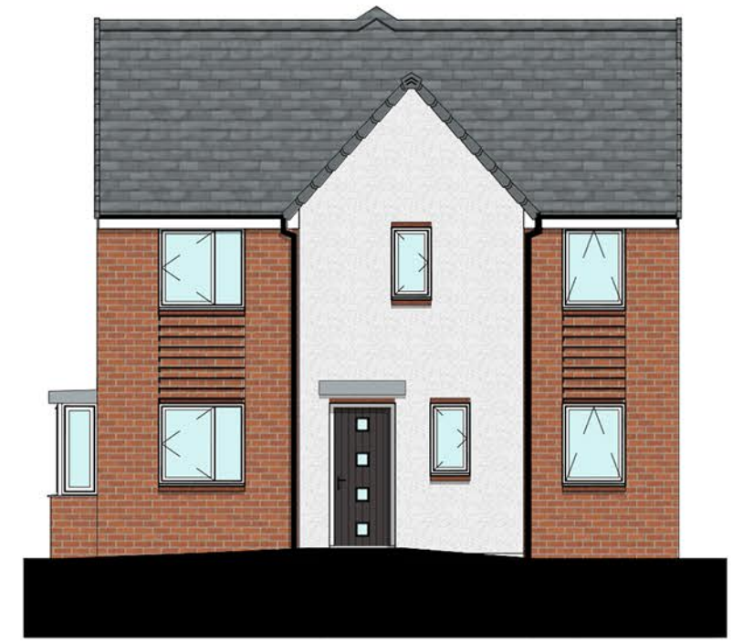
Right Elevation. 1 : 100