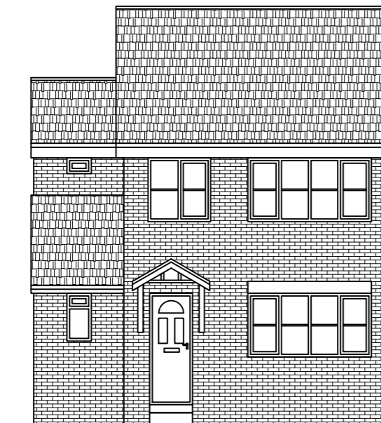
PROPOSED FRONT ELEVATION SCALE 1:100 AT A3