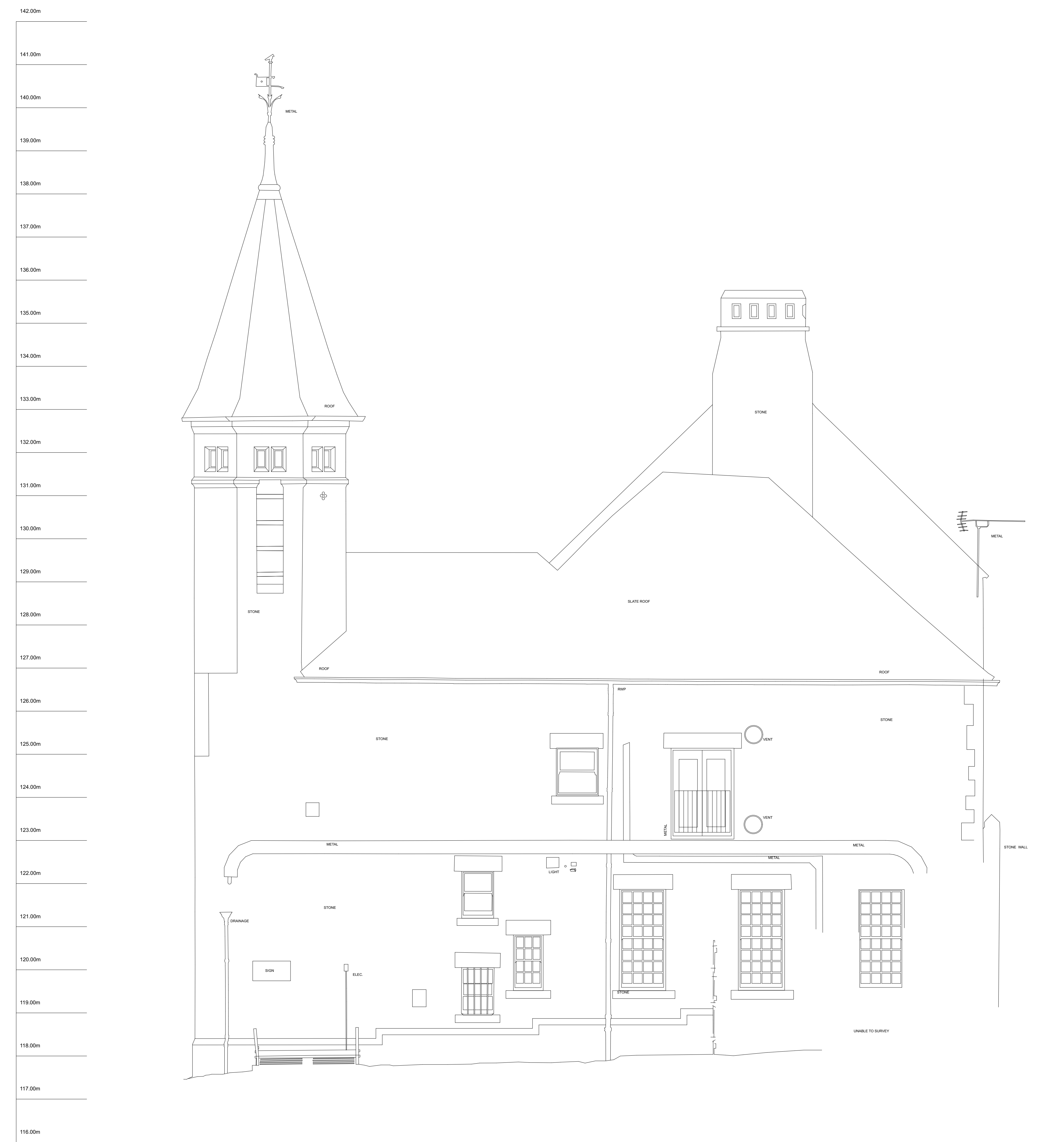
Existing North Elevation 1:50

NOTES: EXISTING ELEVATIONS — EXISTING ELEVATIONS TAKEN FROM BUILDING SURVEY 'P23-004 1E-MET-EXT-XX-ELE-M2-B-001-1-ELEVATIONS' BY MET GEO ENVIRONMENTAL, RECEIVED 2023-09-05