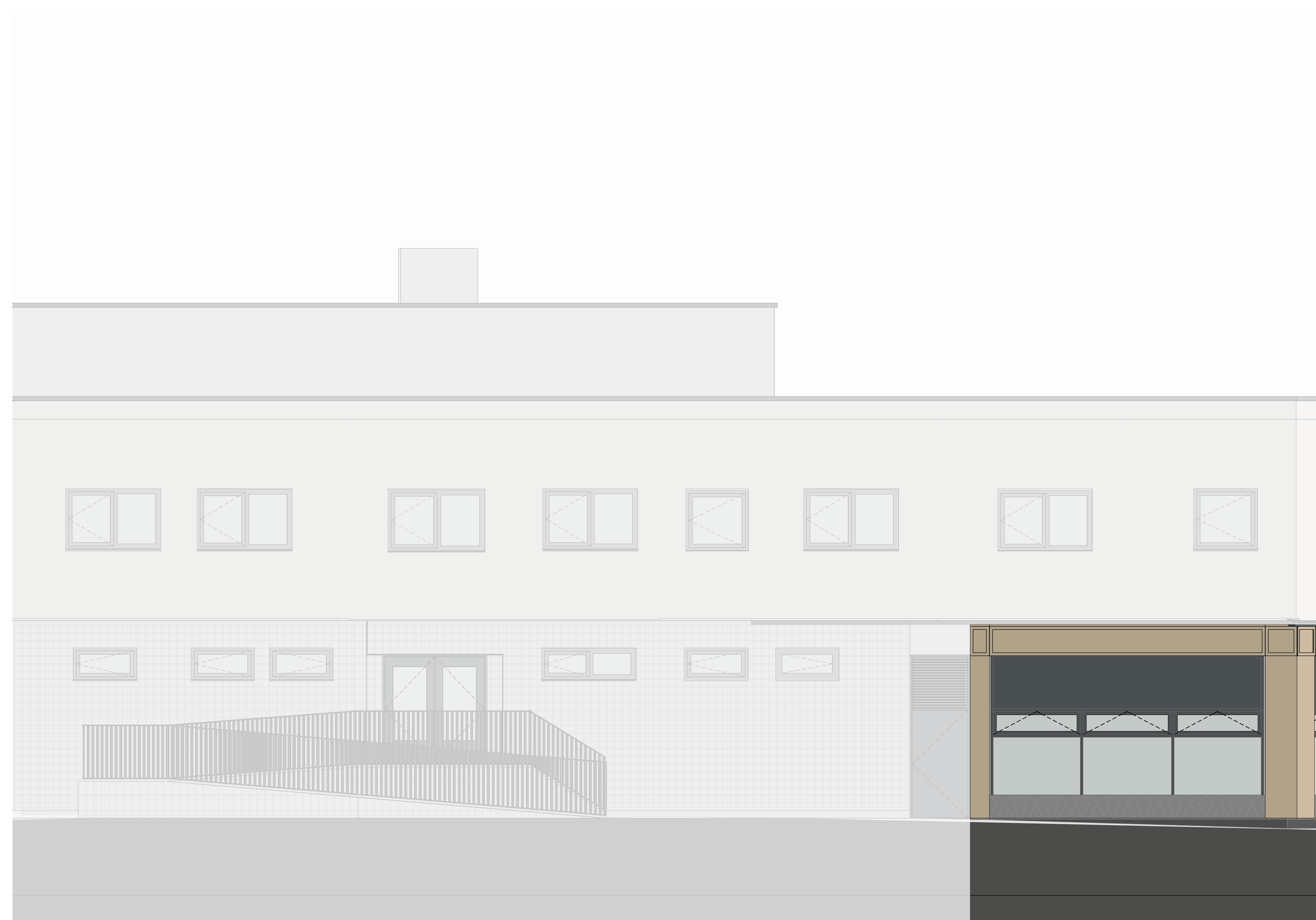
NE ELEVATION 06 1:50

This document is © Bond Bryan Architects Ltd If in doubt ASK. Drawing measurements shall not be obtained by scaling. Verify all dimensions prior to construction. Immediately report any discrepancies on this document to the Originator. This document shall be read in conjunction with associated models, specifications and related consultant documents.