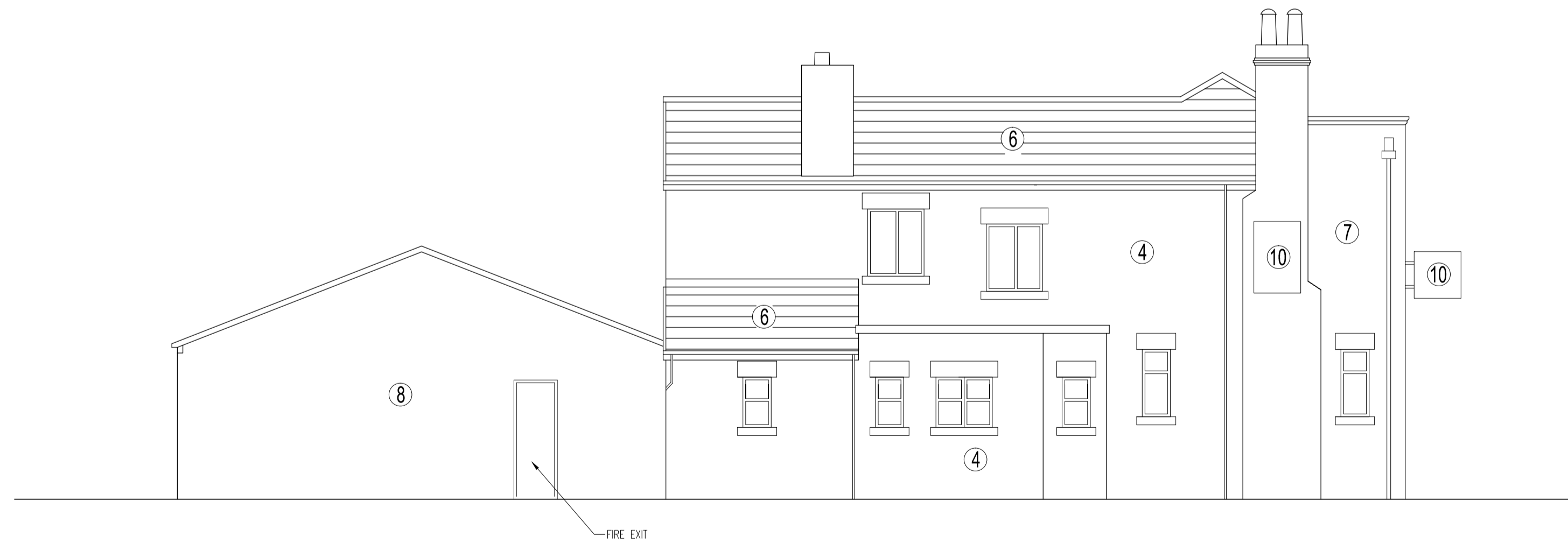
PROPOSED WEST ELEVATION SCALE 1/75