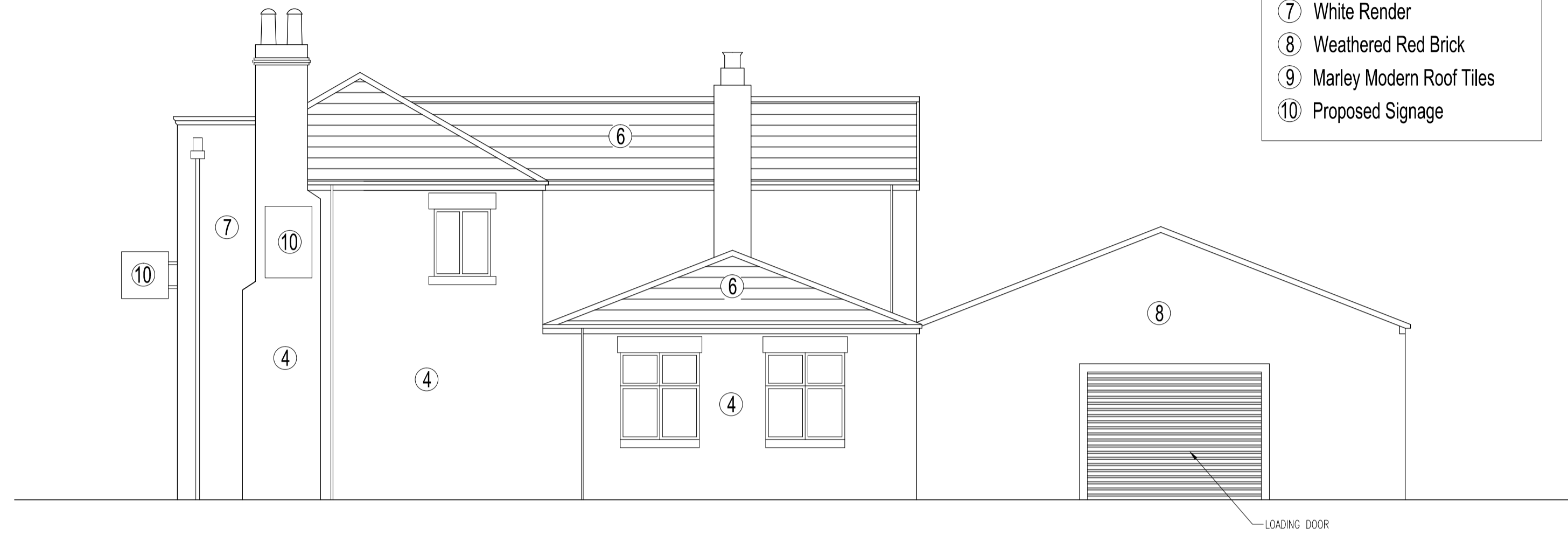
PROPOSED EAST ELEVATION SCALE 1/75