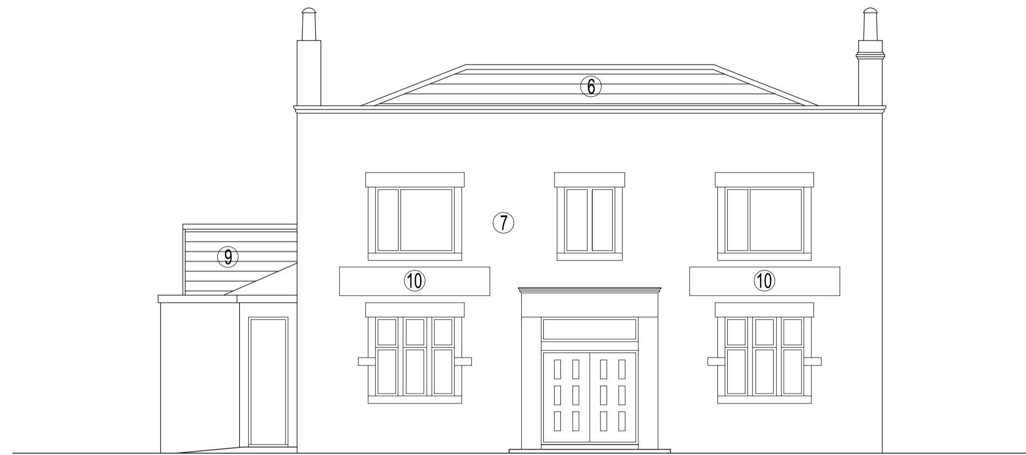
PROPOSED SOUTH ELEVATION SCALE 1/75