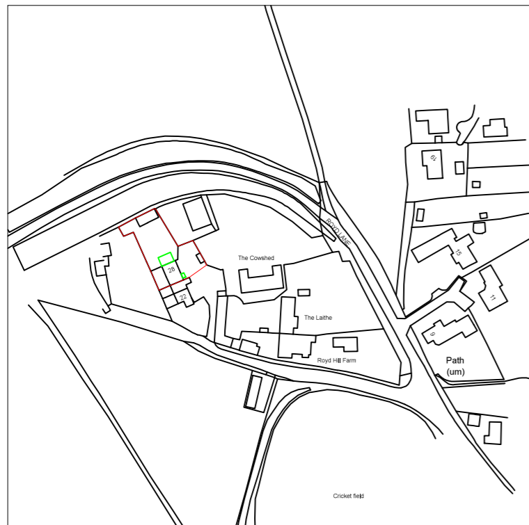
LOCATION PLAN SCALE 1:2500 AT A3