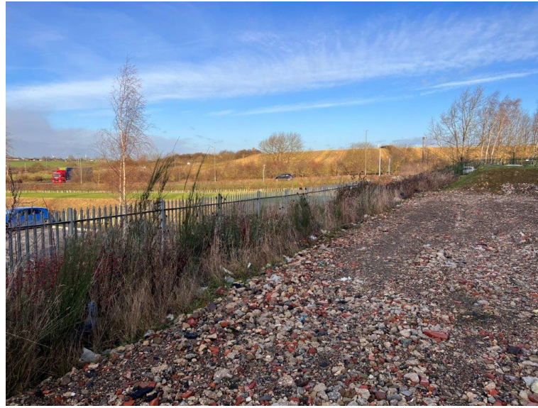
Western Site Boundary