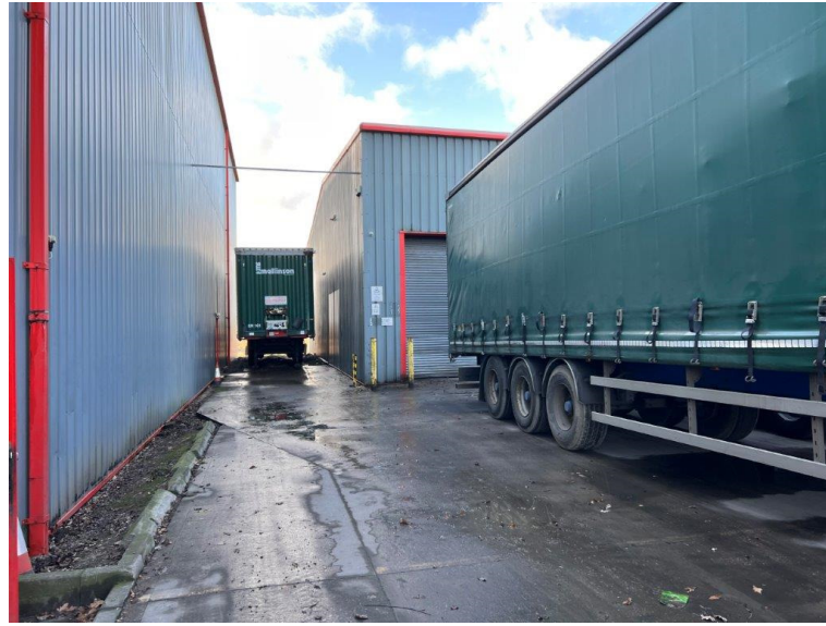
Between North Elevation and Adjacent Building