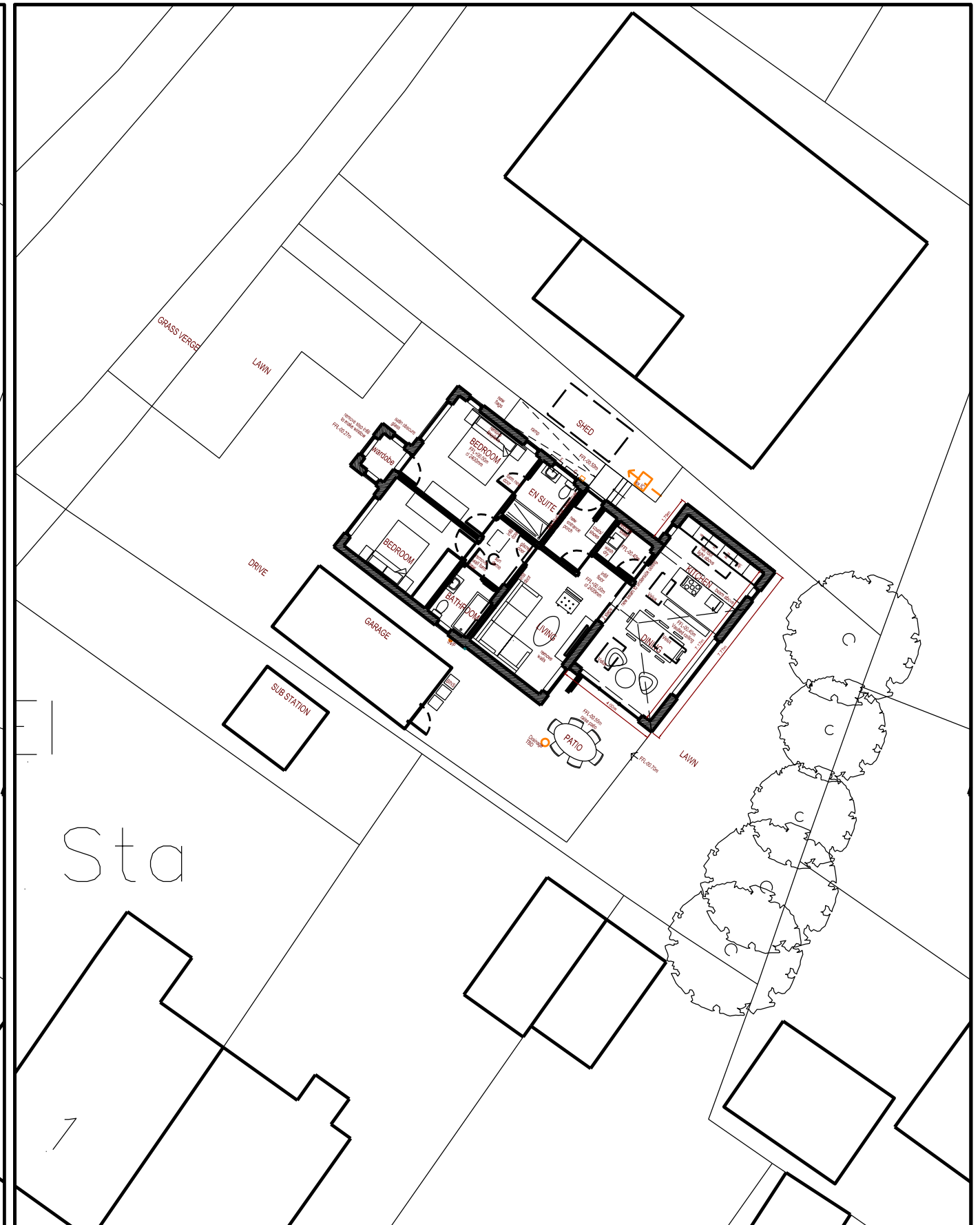
Site Plan - Proposed