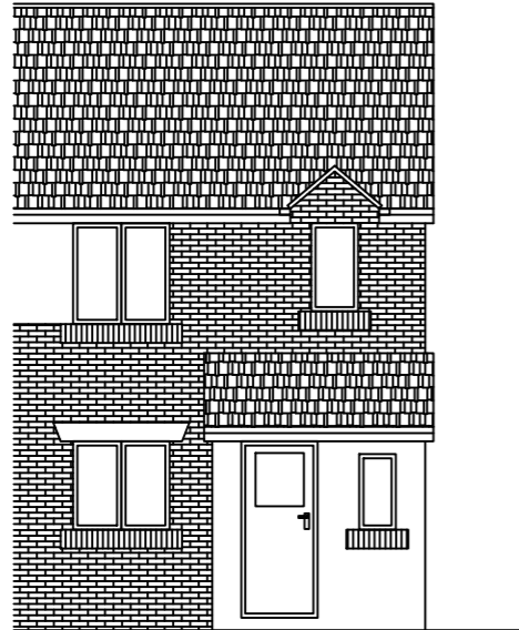
EXISTING FRONT ELEVATION SCALE 1:100 AT A3