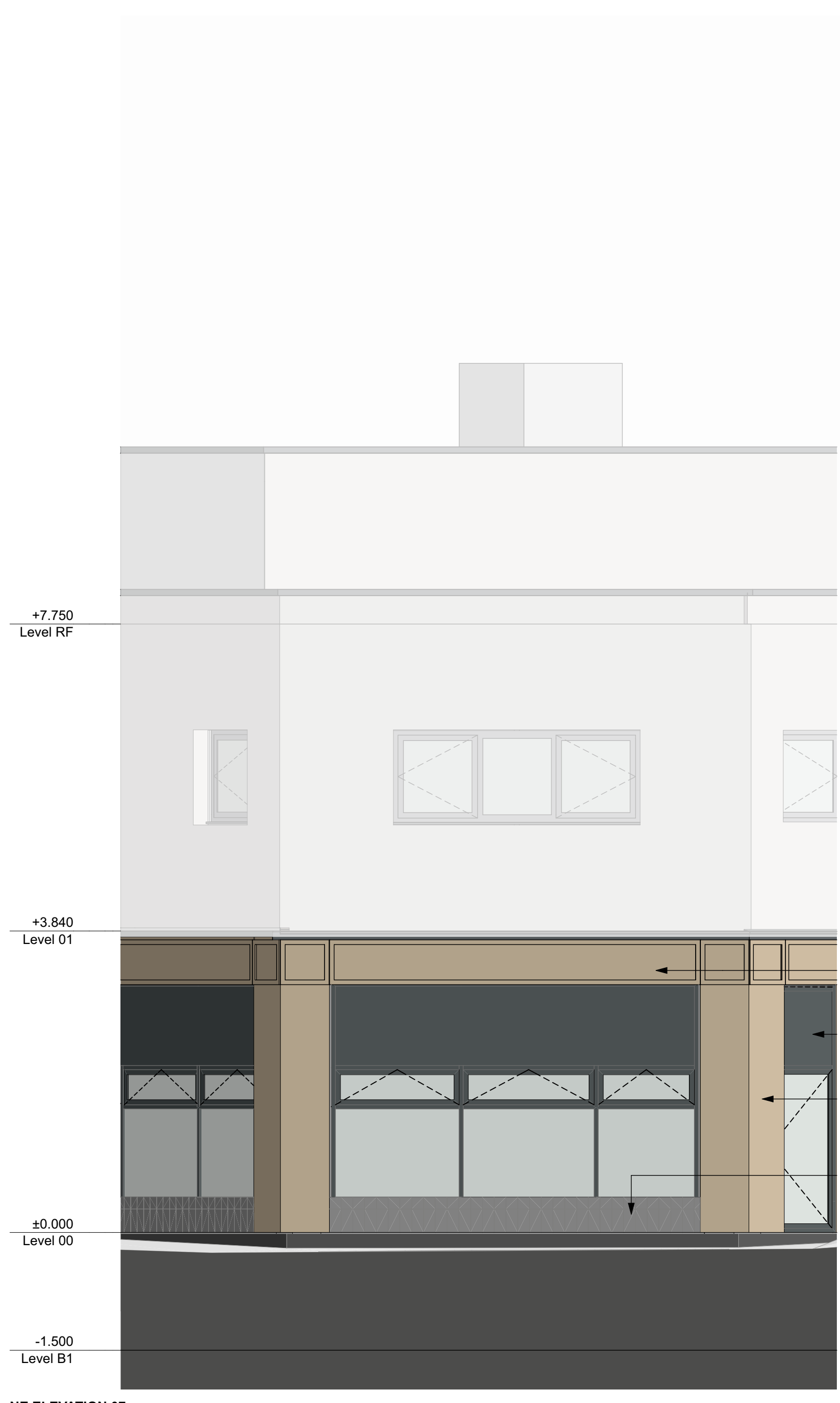
NE ELEVATION 07 1:50