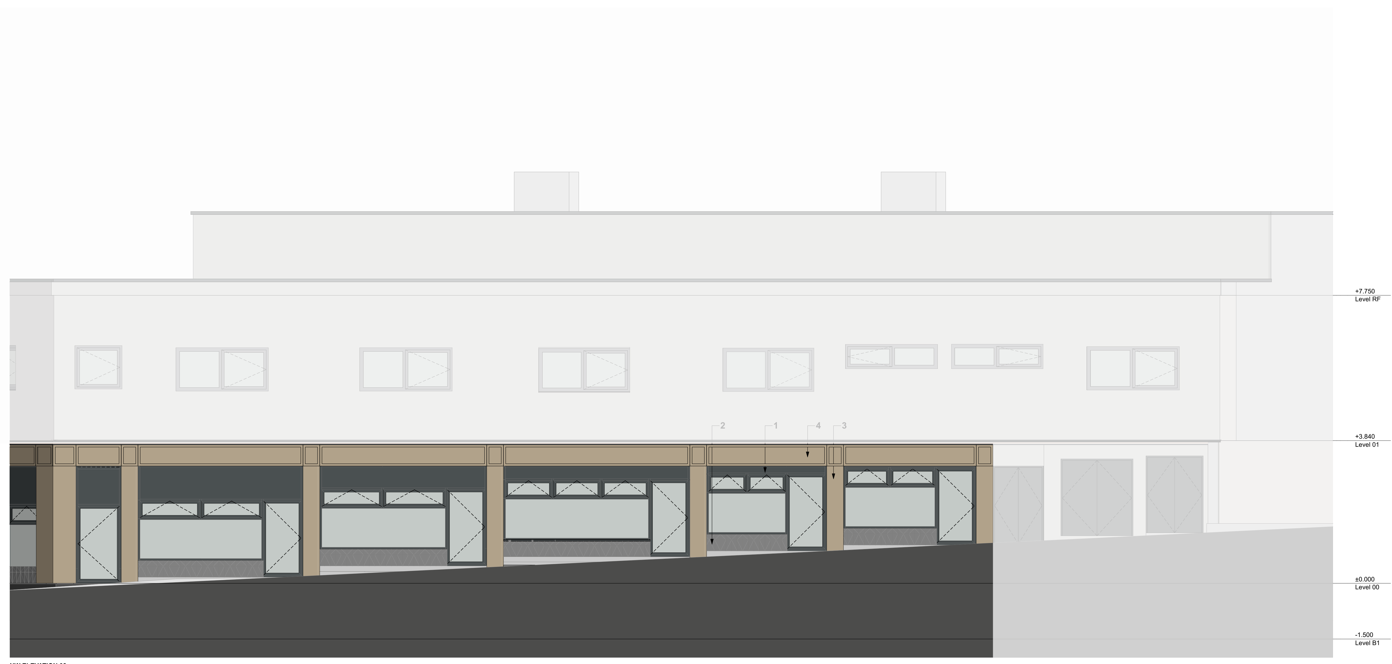
NW ELEVATION 08 1:50

This document is © Bond Bryan Architects Ltd If in doubt ASK. Drawing measurements shall not be obtained by scaling. Verify all dimensions prior to construction. Immediately report any discrepancies on this document to the Originator. This document shall be read in conjunction with associated models, specifications and related consultant documents.