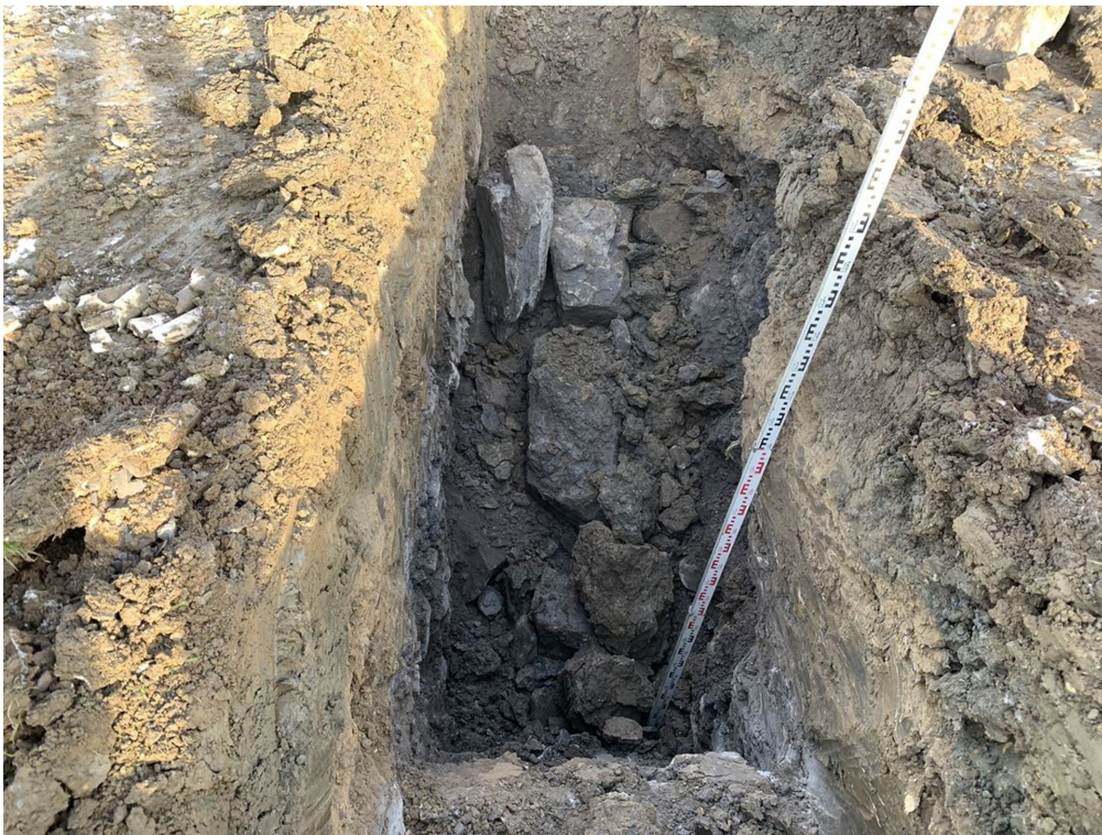
Photograph 46: Trial pit TP06. Collapse of unstable trial pit sides due to opencast backfilling.