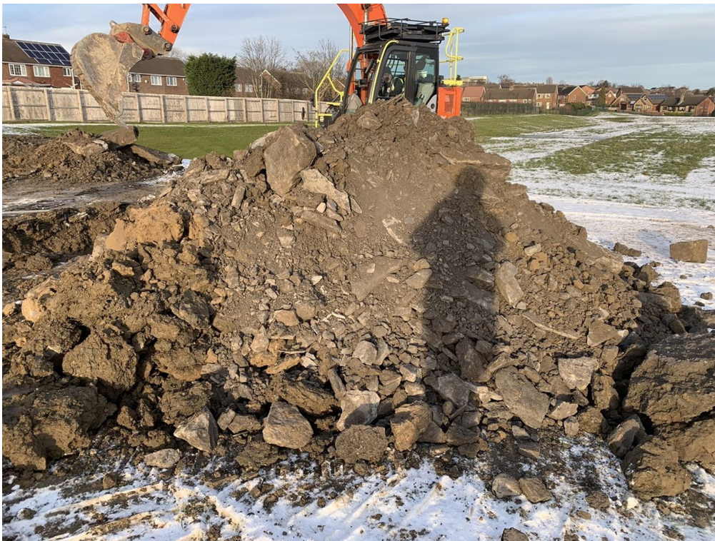
Photograph 48: TP06 arisings. (2).