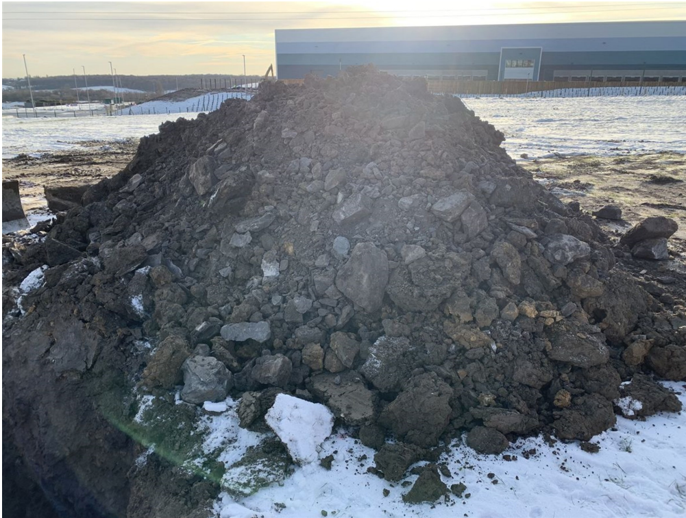
Photograph 40: TP05 arisings. (1).