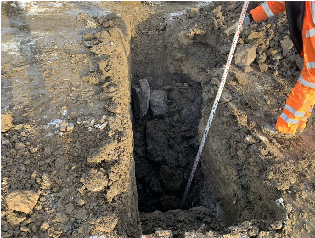
Photograph 45: Trial pit TP06. Eastern face of trial pit, view from the west to the east.