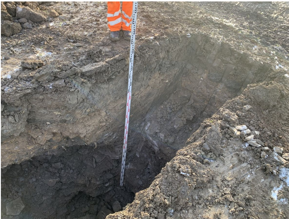
Photograph 44: Trial pit TP06. Western face of trial pit, view from the north east to the south west.