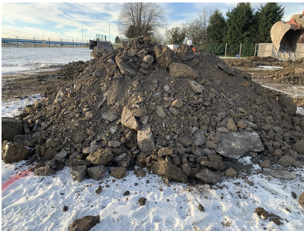
Photograph 49: TP06 arisings. (3).