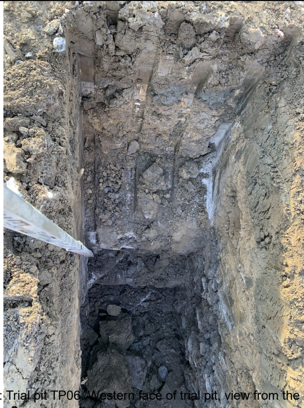
Photograph 43: Trial pit TP06. Western face of trial pit, view from the east to the west.