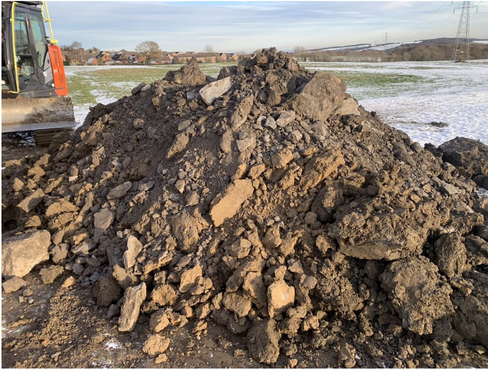
Photograph 47: TP06 arisings. (1).