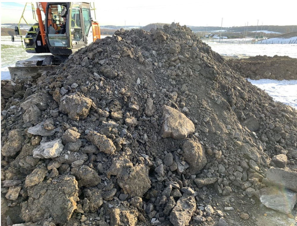
Photograph 41: TP05 arisings. (2).