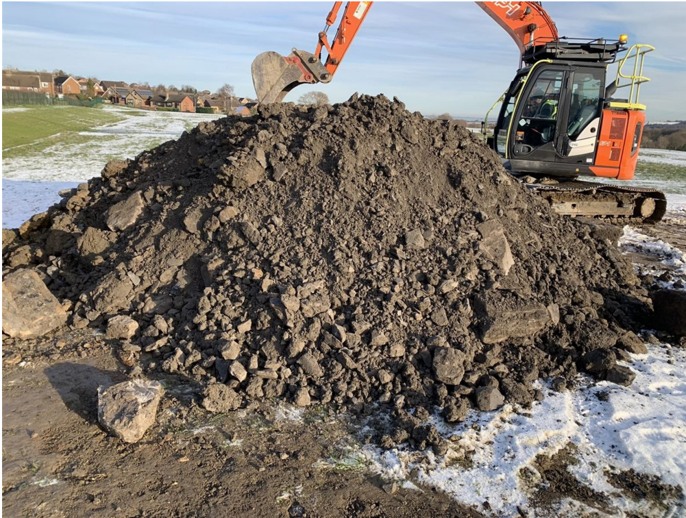
Photograph 42: TP05 arisings. (3).