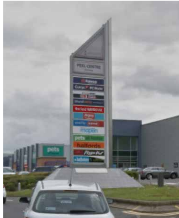
TOTEM B - 2 SIDED