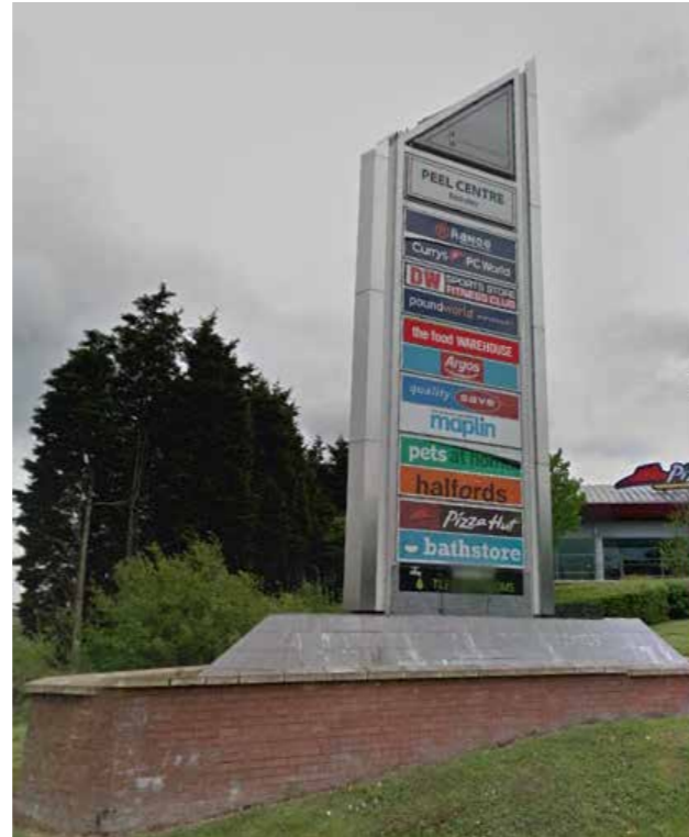
TOTEM A - 3 SIDED