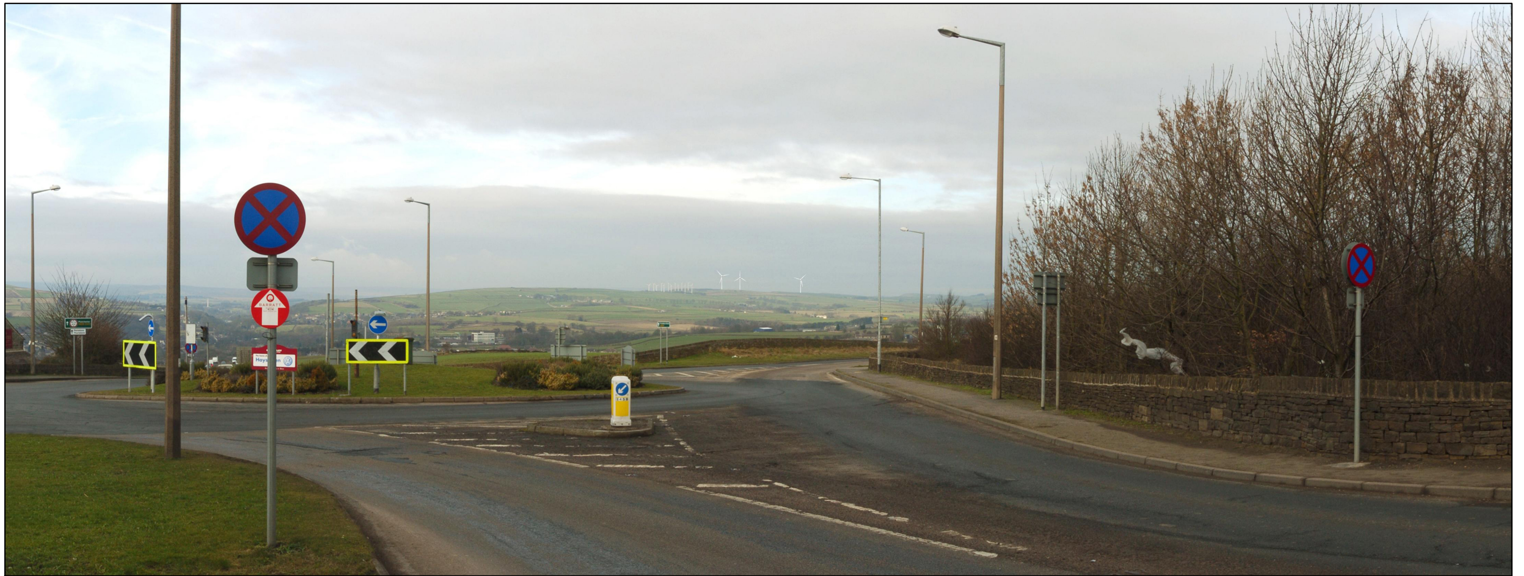
Photomontage showing proposed development from viewpoint