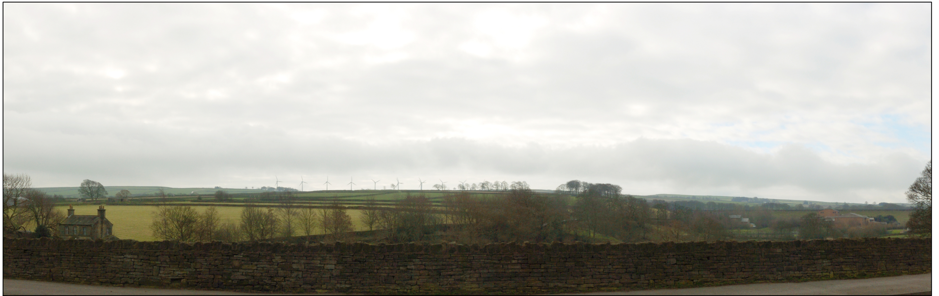
Existing view from viewpoint