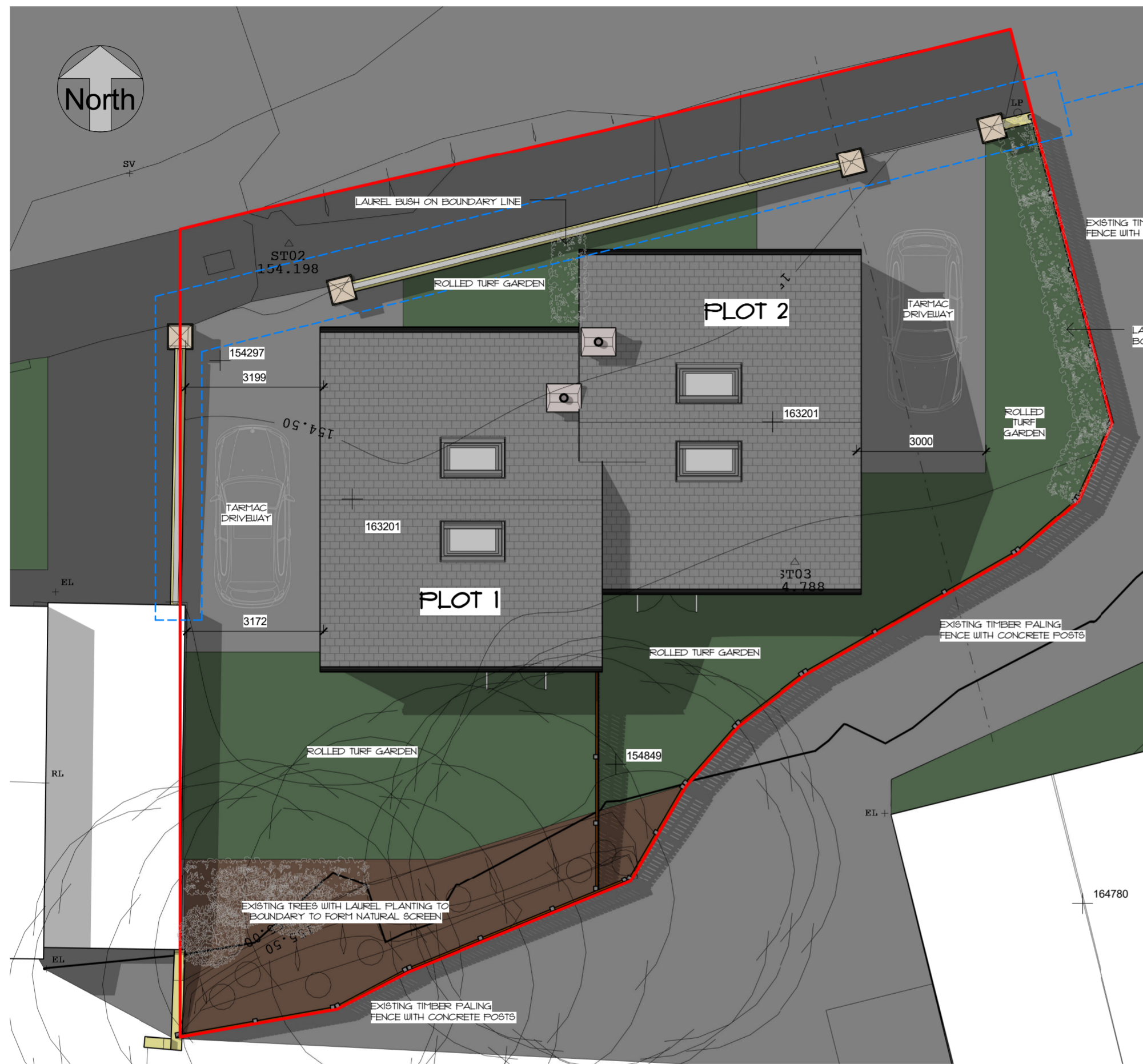
Landscaping Plan 1 : 100