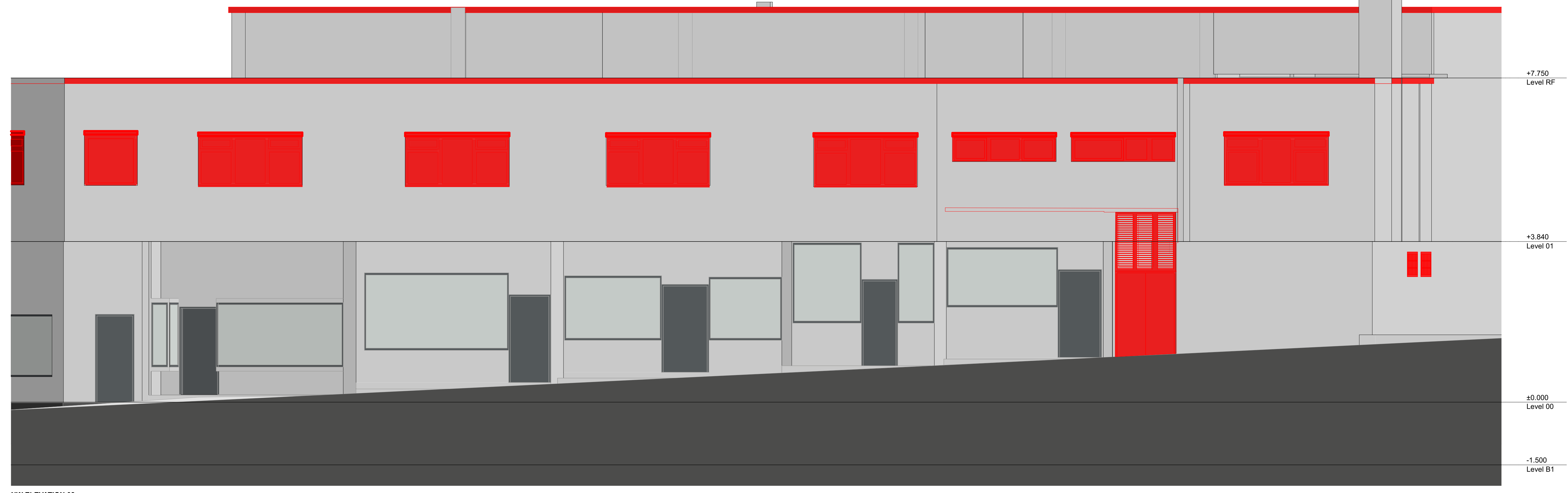
NW ELEVATION 08 1:50