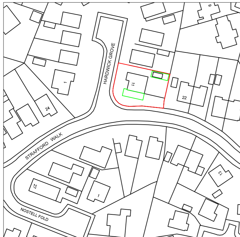
LOCATION PLAN SCALE 1:1250 AT A3