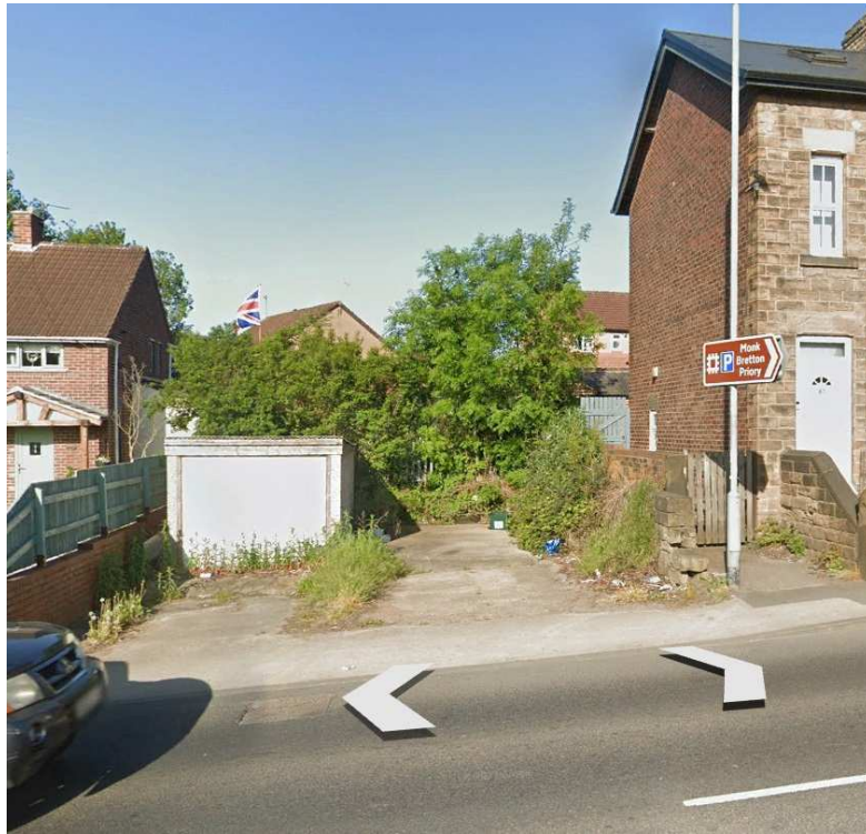
Streetview, vegetation does not meet the requirement for a BS5837: 2012 survey