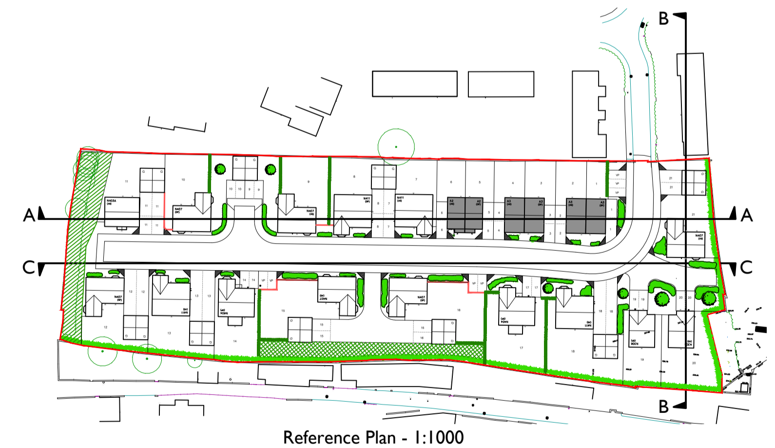
Reference Plan - 1:1000

For illustrative purposes only - refer to the engineers levels information.