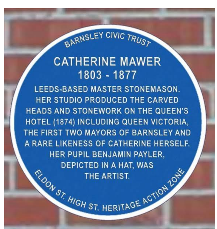
<u>Appendix 2 – Queen's Hotel (Queen's Court Business Centre Blue Plaque</u>

Note: The wording has been changed to read INCLUDING LAYING OUT REGENT STREET AND ELDON STREET