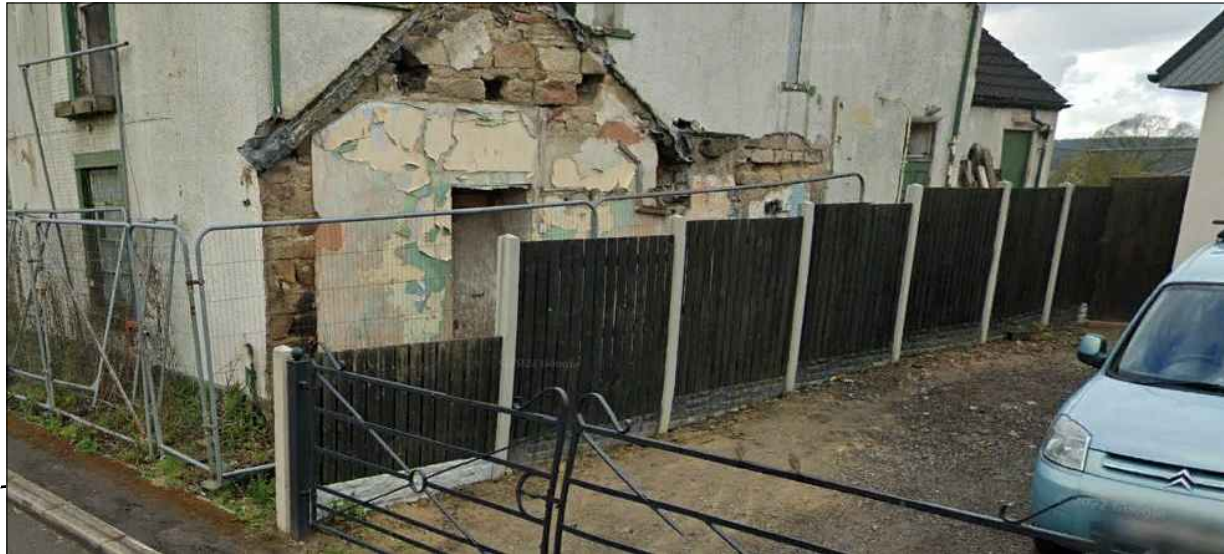
EXISTING 1800MM HIGH FENCE FROM G-H

PROPOSED BOUNDARY TREATMENTS FROM A TO B -EXISTING STONE WALL REPAIRED AS NECESSARY AND RETAINED FROM B TO C -WALL OF ADJACENT DWELLING FROM C TO D - EXISTING 1800MM HIGH TIMBER FENCE- SEE PHOTOGRAPH FROM D TO E- NEW FENCE TO MATCH C TO D. FROM E TO F- POST AND RAIL FENCE 1M HIGH TO MATCH EXISTING FENCE D TO E. FROM F TO G - 1800MM HIGH TO MATCH FENCE G TO H. FROM H TO K AND J TO A - 600MM HIGH STONE WALL TO MATCH NEW DWELLING. THE DOMESTIC CURTILAGE INCLUDES AREA OF GREEN BELT