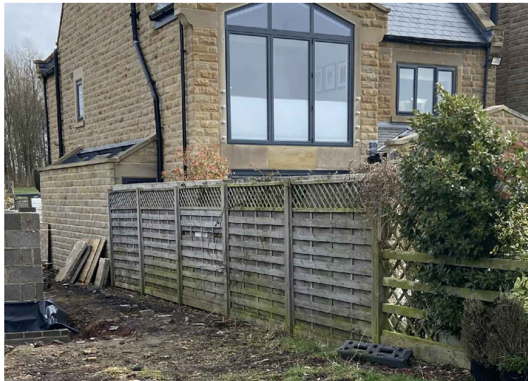
EXISTING 1800MM HIGH FENCE FROM C-D

PROPOSED EXTERNAL MATERIALS TO DWELLING WALLS TO BE COURSED NATURAL STONE WITH MATCHING HEADS AND CILLS, WITH RENDER AS IMAGE BELOW. ROOF TO BE MARLEY MODERN DARK GREY INTERLOCKING CONCRETE TILES WINDOWS TO BE 'ANTHRACITE' UPVC.