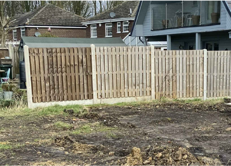
EXISTING 1800MM HIGH FENCE FROM G-H