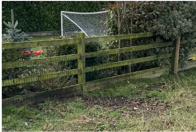
EXISTING 1000MM HIGH FENCE FROM D-E