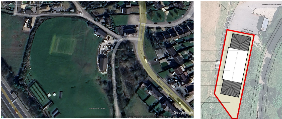
2025 Google Aerial Image showing concerned cricket ground and Proposed Site Plan

Proposed erection of 2no. extensions to the existing cricket clubhouse with associated hard and soft landscaping on a playing field associated with cricket activity.